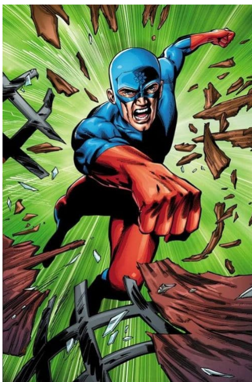
Dr. Ray Palmer (The Atom)

Audiences are best familiar with Dr. Ray Palmer as the original Atom. Ray Palmer developed all of the shrinking techniques alone, unlike his younger colleague Ryan Choi. As The Atom, Ray has seen amazing adventures, learned about micro universes, and established himself as a very valuable member of the Justice League. Ray has made enormous contributions to the scientific community. He has made a name for himself by using his accomplishments to create a multi-billion dollar industry. He has cemented his reputation as one of DC's most intelligent heroes with his findings in the microscopic realm and the study of white dwarf star energy.