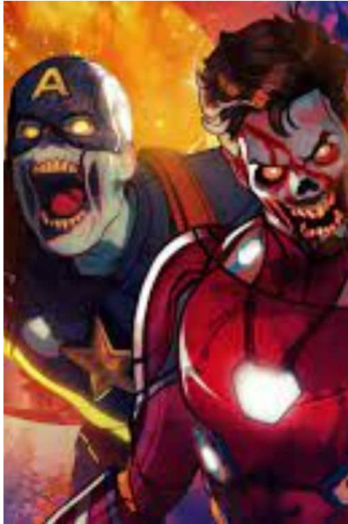
Marvel Zombies - 10 Darkest Marvel Comics

As the name only suggests that something strange, creepy or horror is going on in this comics. This comics was written by Robert Kirkman and this comics lived on its reputation and name. The Marvel Zombies Featured a version of an alternate reality where superheroes have turned into zombies and show no mercy on each other while roaming on the streets in a hungry state. It was not everyone's cup of tea to go through this creepy dark comics.