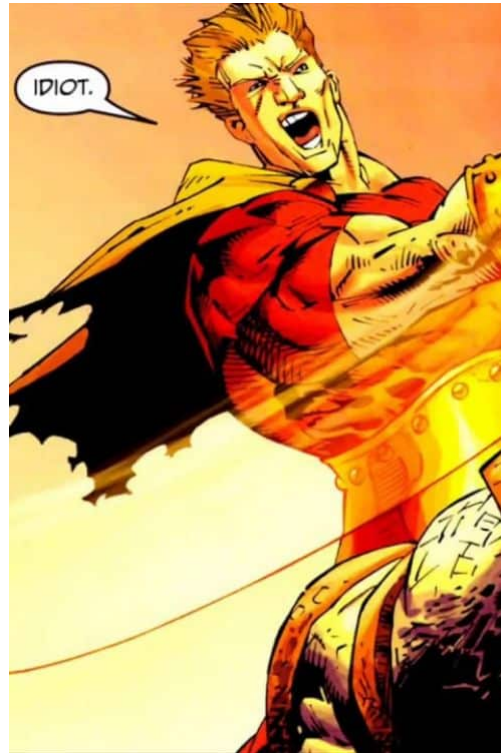
King Hyperion - 10 Darkest Marvel Comics

The Superman of Marvel, 'Hyperion' is the least talked about character in Marvel. This character has similar powers like Superman, but this character is not much talked about in the Marvel Universe. In one of the comics versions 'Earth 4023', Hyperion becomes the ruler of the planet and kills every superhero including superheroes like Thor and Hulk and later people of the planet destroy themselves with the help of nuclear power to get rid of his rule. This is one of the darkest comics of all time.