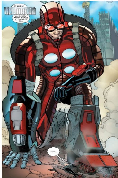
Ultimatum - 10 Darkest Marvel Comics

This brilliant piece was written by Jeph Loeb. Its a revenge saga where characters go to extremes to take their revenge. It also shows the importance of family and how one can go to extremes for their loved ones and forget all the boundaries. This is one of the darkest comics of marvel where in the process of revenge the death tolls make everyone uncomfortable. We also see a human side of our superheroes where they reach a tipping point and breakdown.