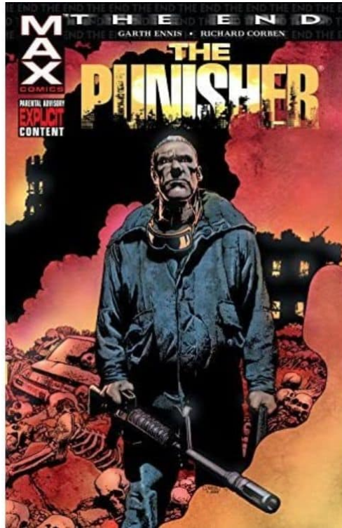
The Punisher: The End

The writer of this comics is Garth Ennis who brings to us a hopeless universe in front of us through his comics. Which makes it a grim and uncomfortable read. In the story the character travels the world post World War 3. Where the world is in a miserable state. Where Punisher takes extreme ways to provide justice for humanity by going on a killing spate. Which eventually brings an end to the existence of the human race.