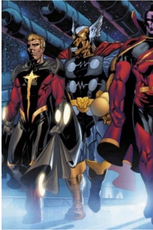
Realm of Kings - 10 Darkest Marvel Comics