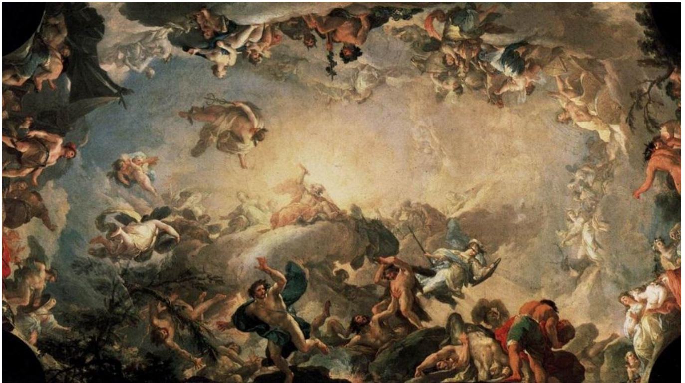
Who is Atlas in Greek Mythology - Myth of Atlas - Titanomachy

Atlas is a prominent figure in Greek Mythology and has played a significant role in various myths. The story of Atlas begins with his origin as a Titan and his involvement in the Titanomachy, the epic battle between the Titans and the Olympians. Later, he encounters