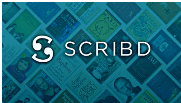
Top 5 Websites For Audiobooks