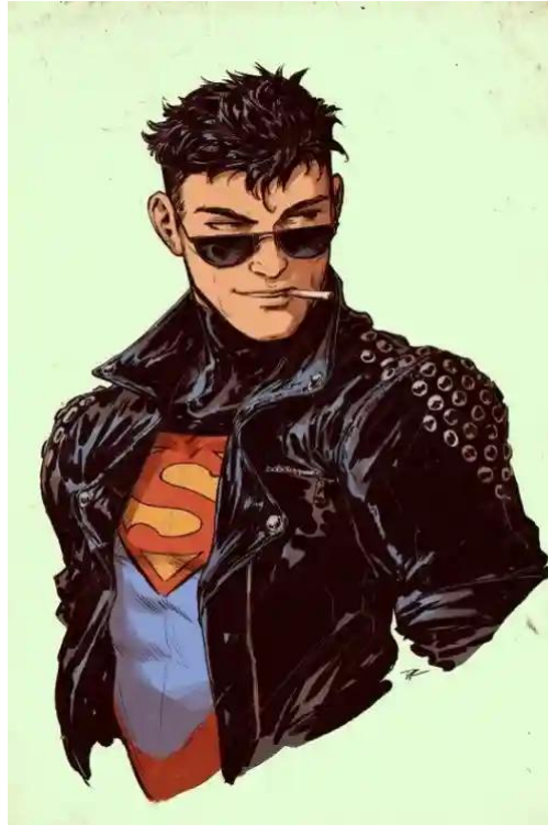
The Origin story of Superboy (Conner Kent)