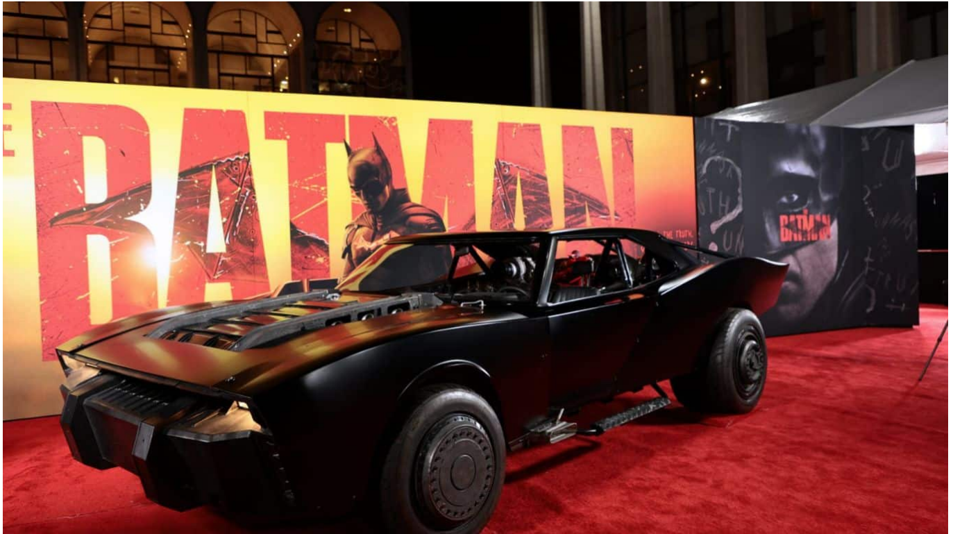
The Batman (2022) Batmobile