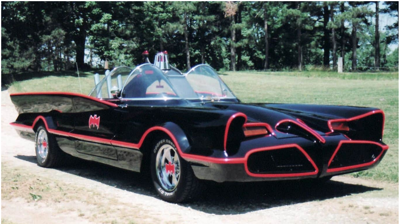
The Best Batmobiles of All Time From Batman Movies - Batman '66 Batmobile