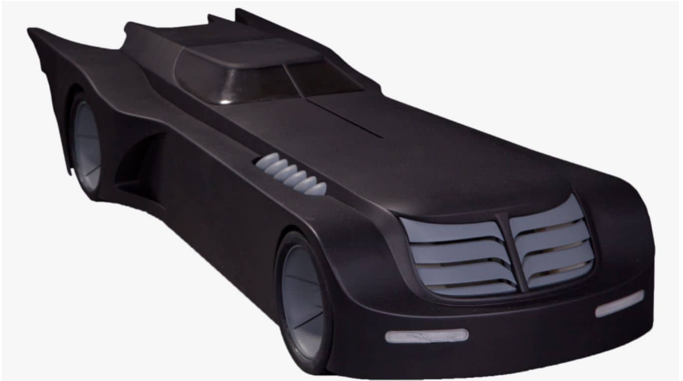
The Best Batmobiles of All Time From Batman Movies - Animated Batmobile (Mask of the Phantasm)