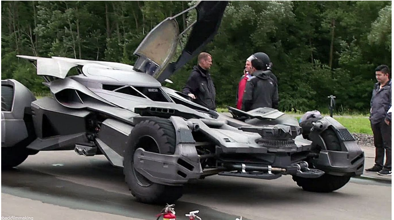
Batman V Superman Batmobile