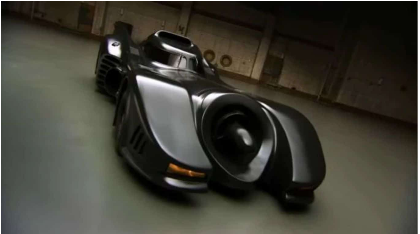
Batman '89 Batmobile