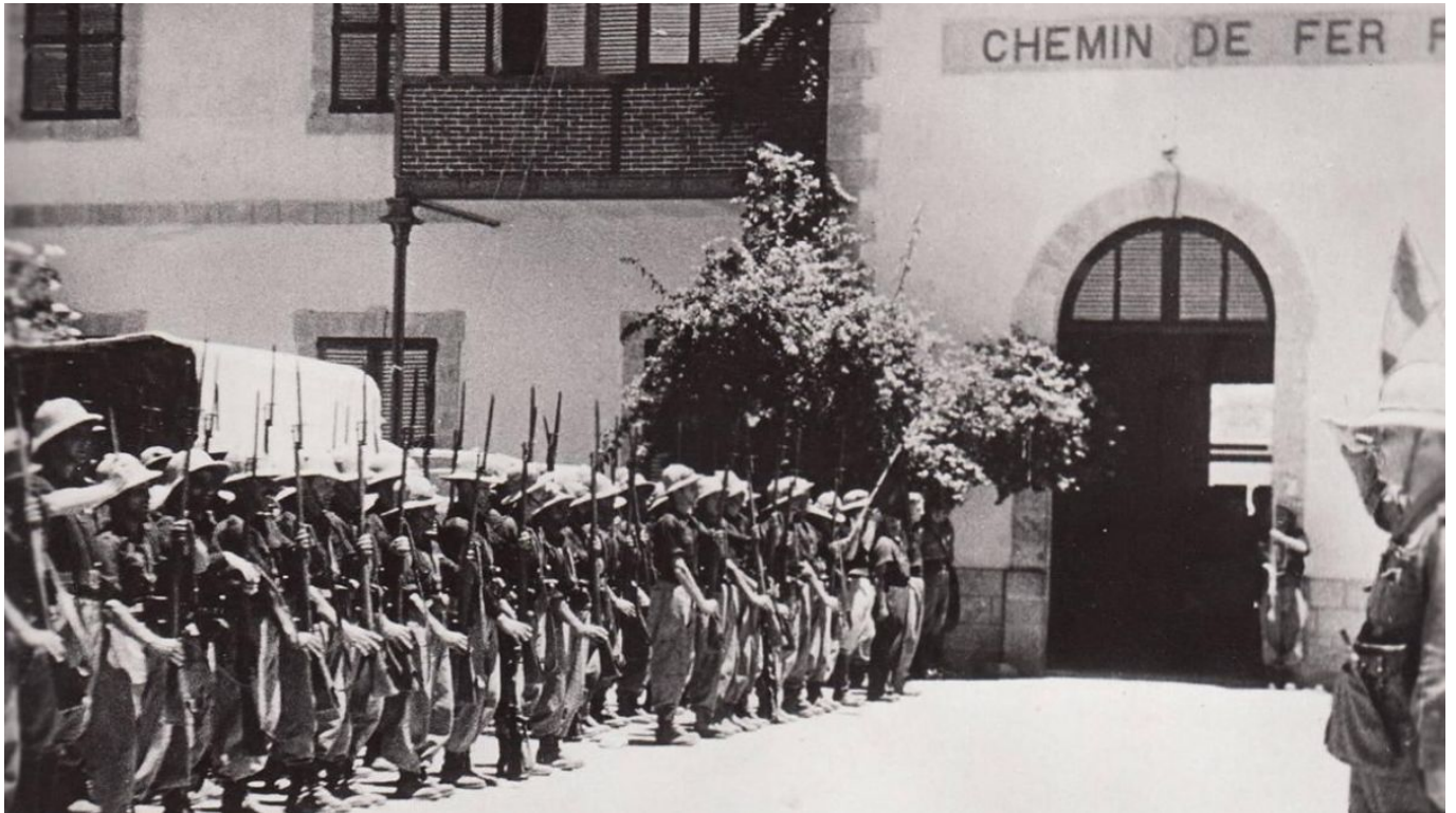
Major Historical Events on May 9 - Italy Annexes Ethiopia - 1936 AD

Seven months after forcing Emperor Haile Selassie I into exile and invading Ethiopia, Italy annexed the country as part of Italian East Africa.