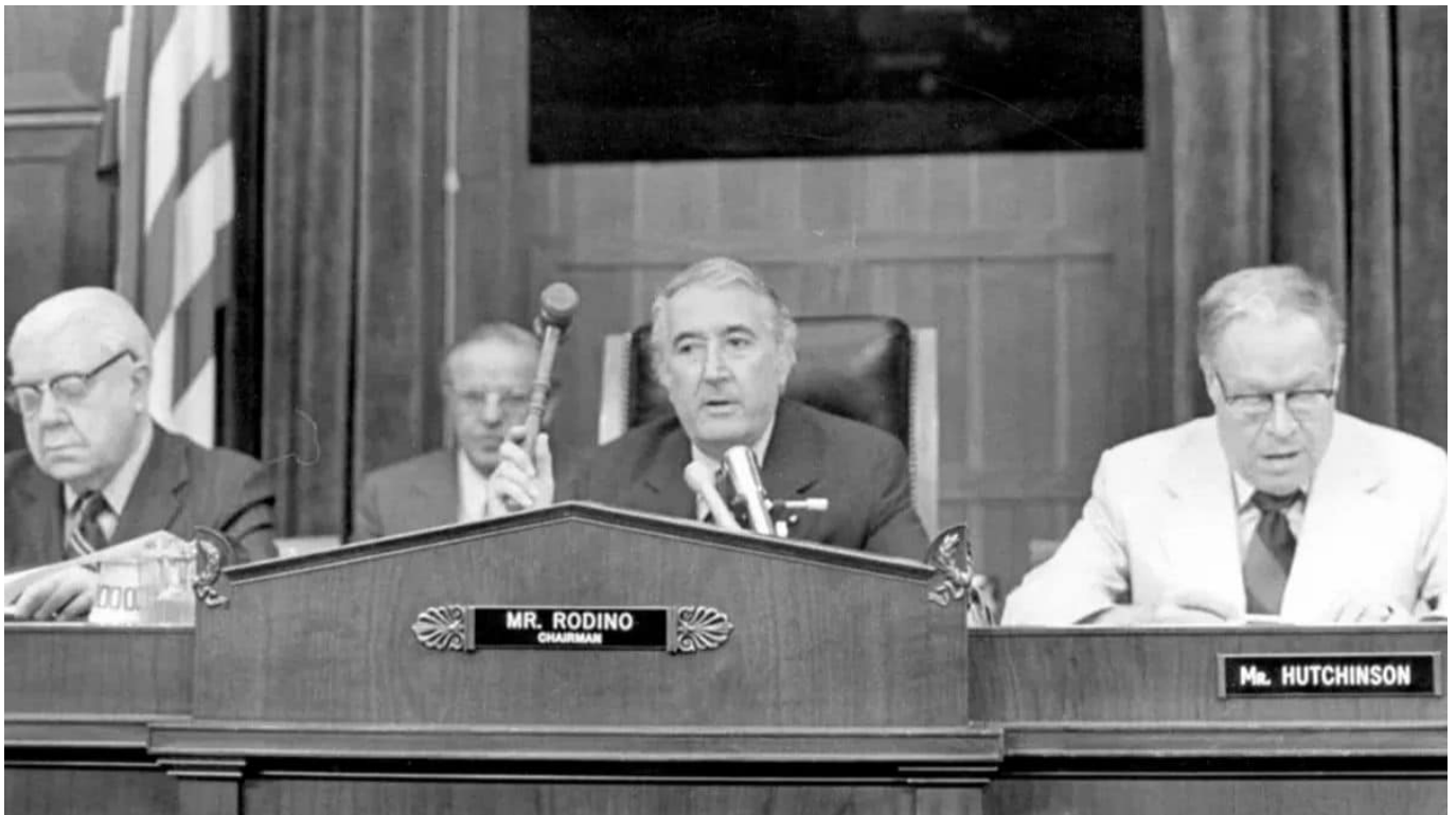
Major Historical Events on May 9 - Nixon Impeachment Hearings Commence - 1974 AD

The U.S. House Judiciary Committee initiated formal hearings in the impeachment investigation of President Richard M. Nixon.