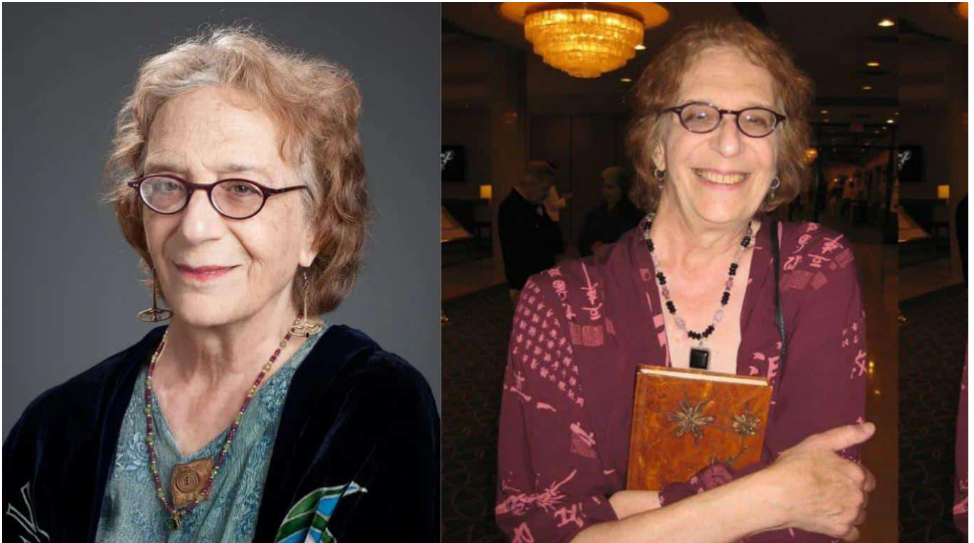
Famous Authors and Writers Who Died In April 2023 - Rachel Grace Pollack