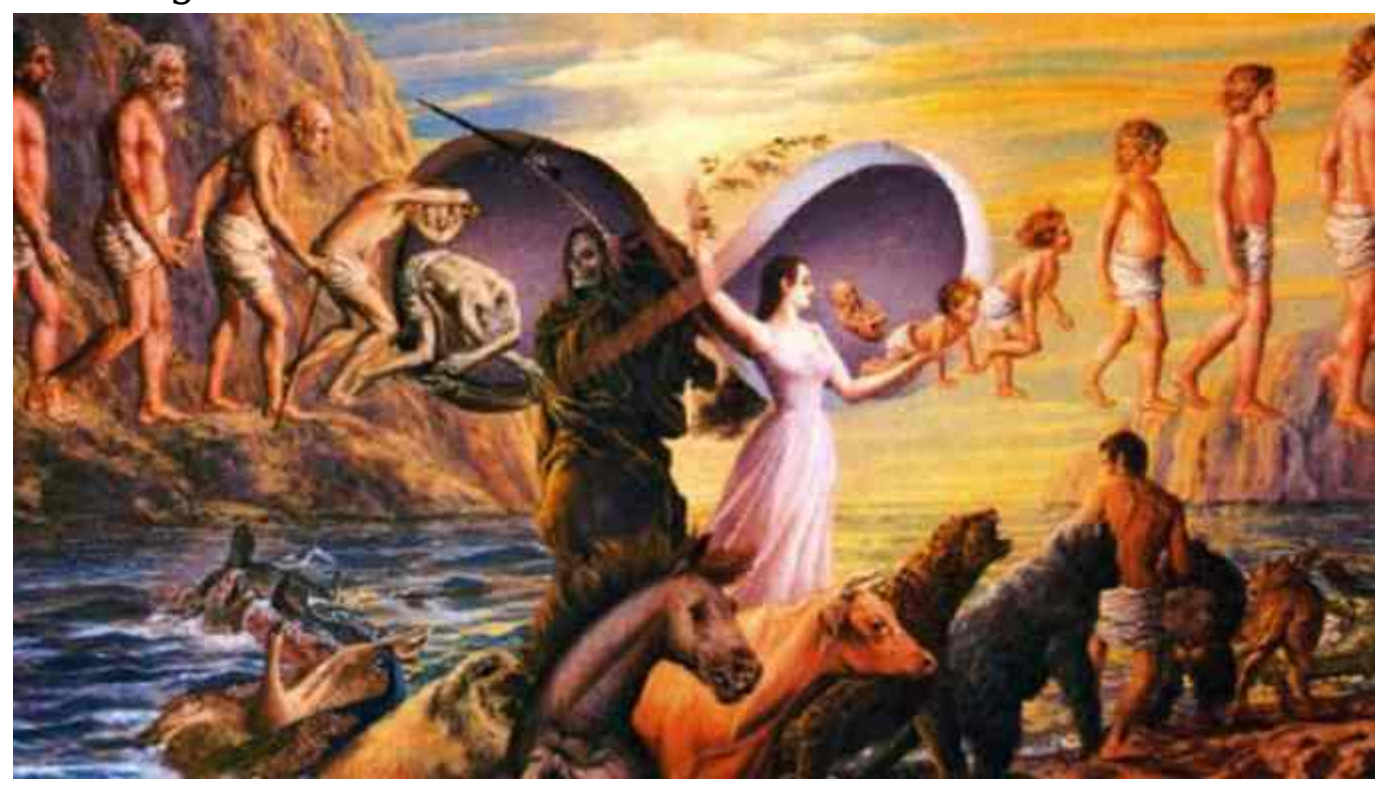
4 Yugas in Hinduism and their Importance - Kali Yuga

'Kali Yuga' is the fourth and last Yuga (according to the Hindu texts and scriptures). This Yuga is said to be the worst Yuga out of the four Yugas. It is the most dark & evil Yuga where darkness & evil will take over humanity. In this phase humanity and morality will reach its lowest point. A point that can scare and hunt even the bravest person out there. In the Kali Yuga people will lose their consciousness and will only be filled with negative emotions like anger, greed and lust. With every passing day the righteousness, humanity and peacefulness of the society will decrease and reach a point of utter misery and darkness.