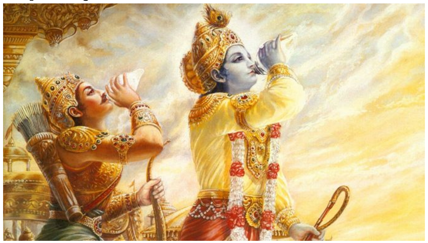
4 Yugas in Hinduism and their Importance - Dvapara Yuga

Dvapara Yuga is the 3rd Yuga which arrived after the falling of Treta Yuga. This Yuga lasted for 864,000 years which accounts for 2,400 divine years. In this Yuga the Dharma only stands on its 2 legs (two pillars) which will later be on a single leg in the last and current 'Yuga of Kali Yuga'. In this Yuga people started leaving the path of Dharma, morality and spirituality. The misuse of power, corruption started to occur frequently in the Dvapara Yuga. The Bronze age saw a rapid rise in selfishness.