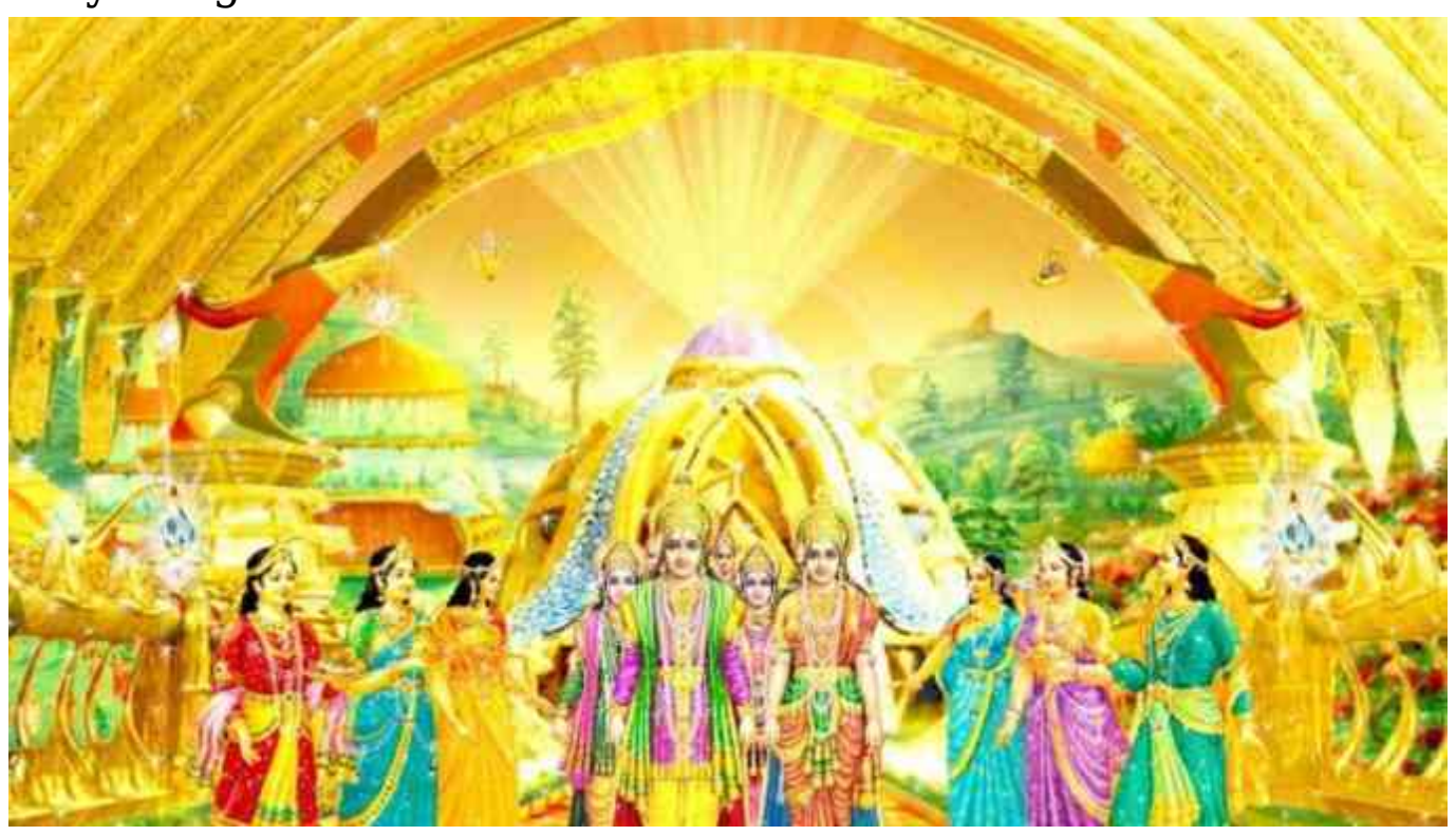
4 Yugas in Hinduism and their Importance - Satya Yuga

The first Yuga is termed as 'Satya Yuga' or 'Krita Yuga'. It is considered to be the best Yuga