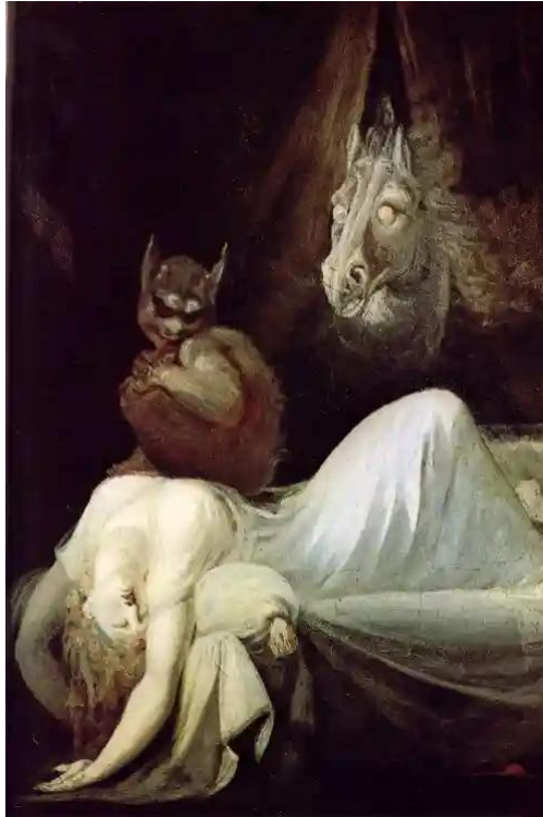
Top 10 Monsters From Norse Mythology - Mare

The Mare monster would sit on individuals while they slept at night, giving them horrible dreams. The Mare was thought to be the souls of living individuals who, like demons, departed from their bodies at night. These were frequently witches, whose souls assumed animal forms, but it was also believed that normal humans, especially teenagers, may transform into Mare when their spirits wandered. It was a popular belief that the spirit wandered at night. Odin was concerned that one day his spirit could leave his body because it left so frequently. Additionally, it was said that whenever the Mare came into contact with a live creature, such as a person, a cow, or a tree, their hair would become tangled. This was most likely used to explain the Polish plait phenomenon, a hair condition. It was also alleged to be the cause of some trees' branches and roots intertwining.