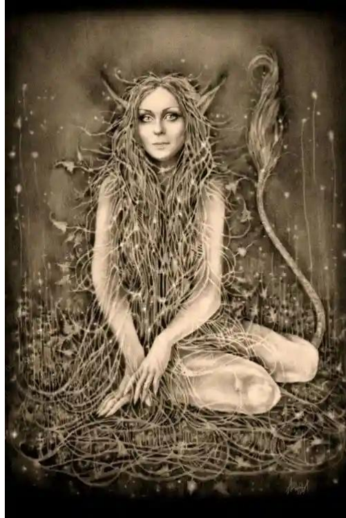
Top 10 Monsters From Norse Mythology - Huldra

The Huldra are guardians of the forest and members of a group of Ra that guards various sites. The female Hydra is invariably depicted as being stunningly attractive and sensual, but with a cow-like tail and a back covered in bark. To navigate the world of men, the Huldra can pass for young ladies. They can only lose their illusion if someone notices their tail. Young, single males are lured into the forest by the Huldra when they visit communities in order to serve as slaves, and lovers, or occasionally to drain their life force. If one of their victims is freed or manages to escape, they will never again feel the want to go back to their captor.