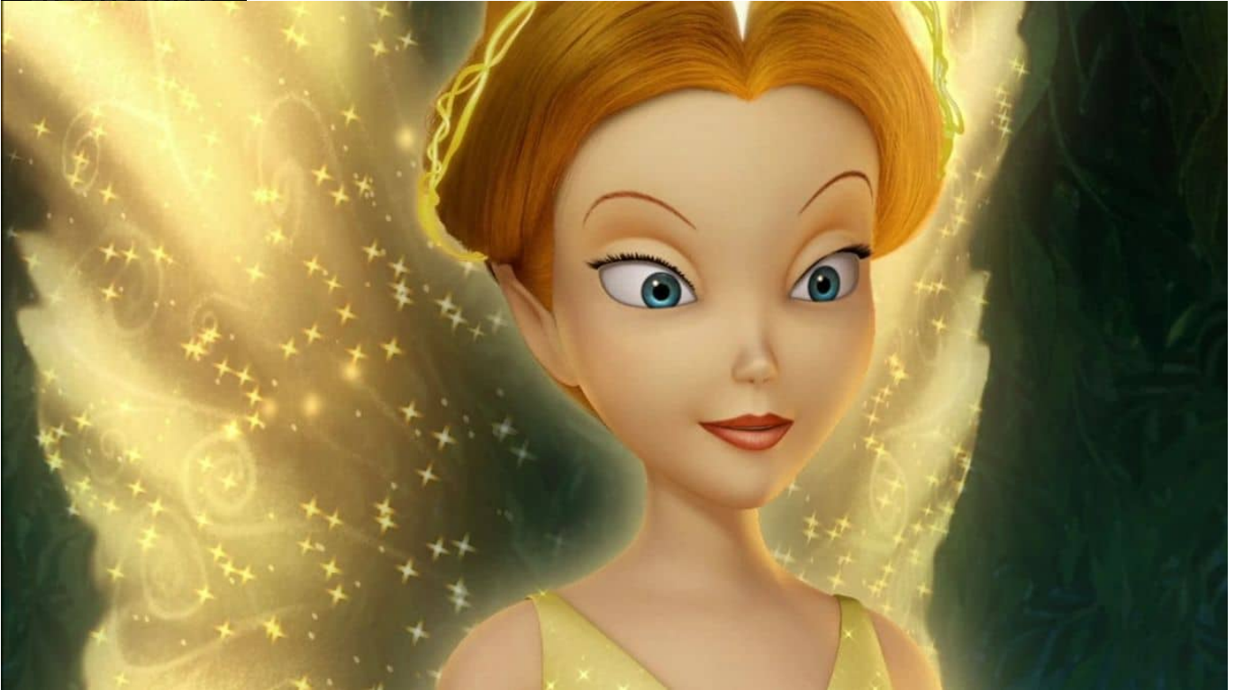
Top 10 Disney Characters whose names start with Q - Queen Clarion (from the “Tinker Bell” movies)

In the magical world of Pixie Hollow, there is a fairy known as Queen Clarion. She plays a vital role in the “Tinker Bell” movies, serving as a wise and caring leader to all the fairies.