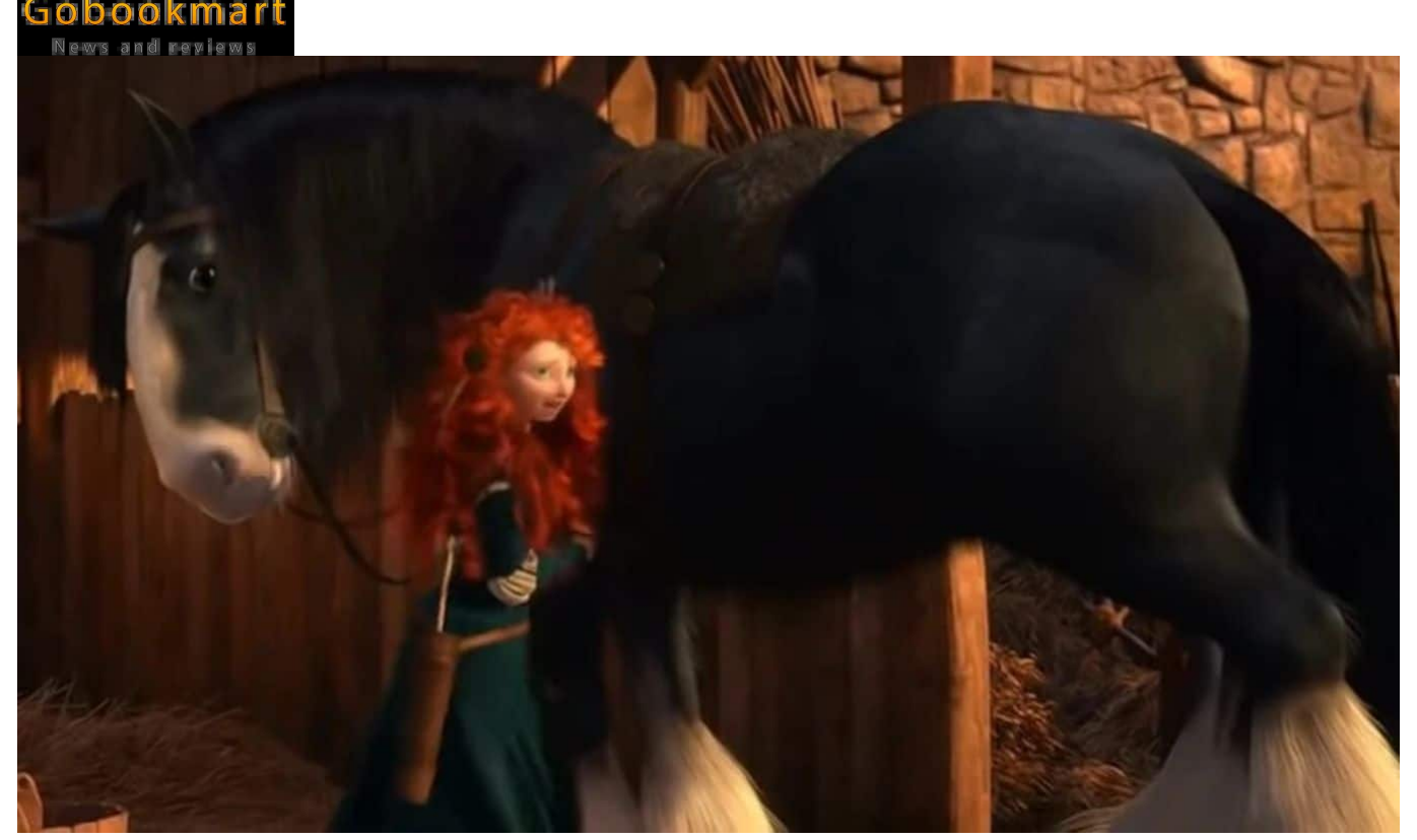
Top 10 Disney Characters whose names start with A - Angus Angus, a majestic Shire horse from Disney/Pixar's "Brave," is Merida's loyal steed and companion. Despite occasional stubbornness, Angus remains devoted to Merida, accompanying her on adventures from spirited forest rides to seeking out the Witch's Cottage following the mysterious will o' the wisps.

When Queen Elinor is transformed into a bear, Angus aids Merida in her quest to reverse the curse. Their strong bond is underscored in the film's end as they, alongside Queen Elinor, traverse the Scottish landscape together, symbolizing familial reconciliation.