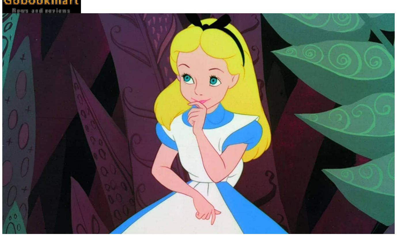
Top 10 Disney Characters whose names start with A - Alice

Alice, from "Alice in Wonderland," is a curious adventurer who takes us on a whimsical journey down the rabbit hole. With her bright eyes and insatiable wonder, she navigates a dreamy realm of peculiar creatures and puzzling riddles.