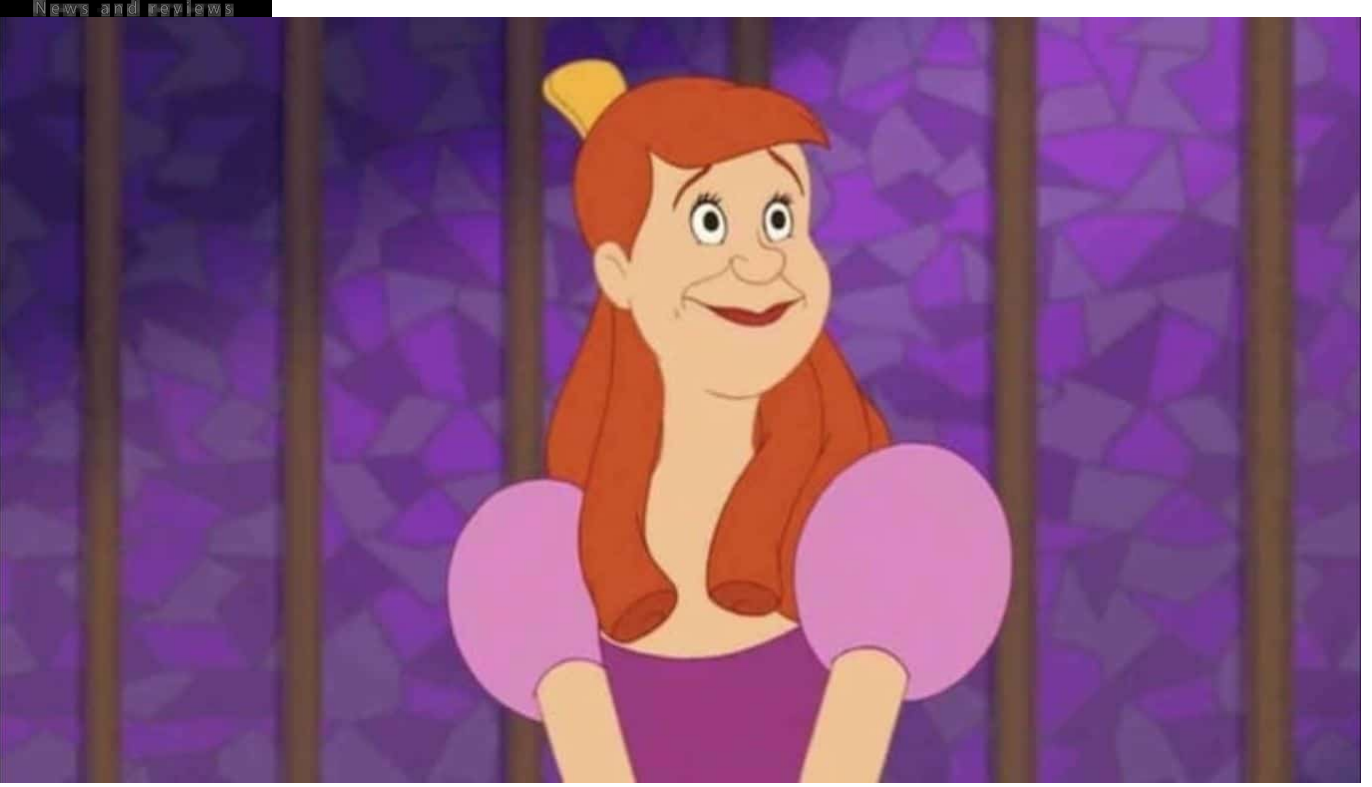
Top 10 Disney Characters whose names start with A - Anastasia Tremaine Anastasia Tremaine, initially depicted as an unkind stepsister in Disney's "Cinderella," undergoes significant character development in subsequent films. While she starts as a demanding and less-attractive character, later sequels reveal her deeper layers. In "Cinderella II", she falls for a baker, learning the value of genuine love with Cinderella's encouragement.

"Cinderella III: A Twist in Time" showcases her moral struggles and eventual stand against her manipulative family for the sake of true love. As her character evolves, so does her appearance, transitioning from plain to more endearing. This growth makes Anastasia a more relatable and likable figure to the audience.