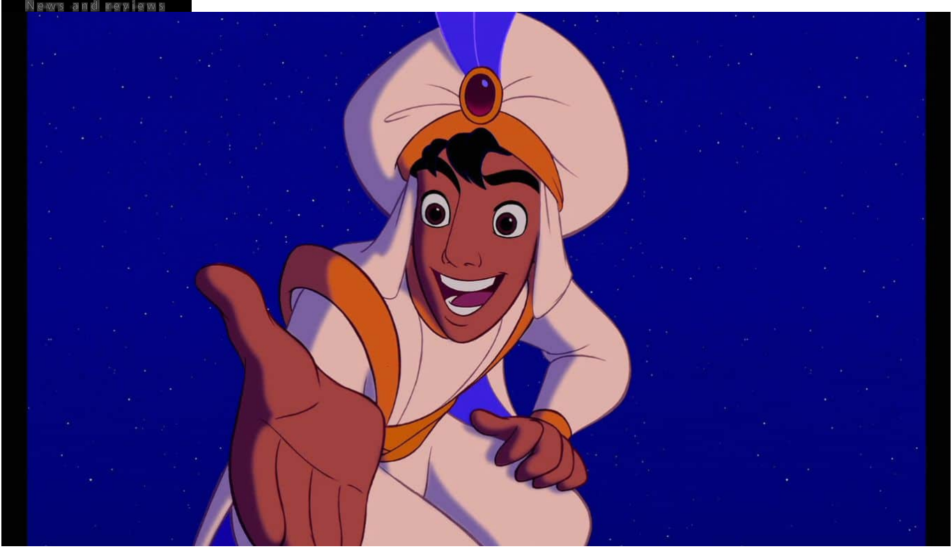
Top 10 Disney Characters whose names start with A - Aladdin

Aladdin: The 'street rat' who stole our hearts! With his swift wit and genuine heart, Aladdin is more than just a classic hero - he's the embodiment of hope and ambition. From the bustling streets of Agrabah, where he cleverly outsmarts merchants to feed himself, to the grandeur of the palace as 'Prince Ali,' Aladdin showcases the journey of a young man who, despite life's knocks, never loses his spirit or integrity.