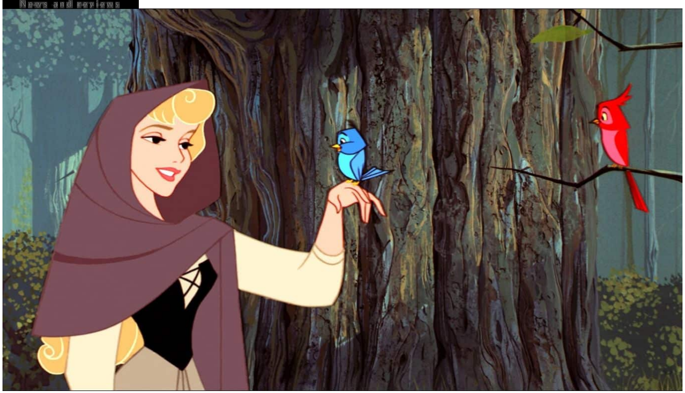
Top 10 Disney Characters whose names start with A - Aurora

Aurora, often recognized as Sleeping Beauty or Briar Rose, epitomizes the innocence and purity of classic Disney princesses. Raised secluded from the world, her kindness shines through her interactions with nature and woodland creatures, painting a picture of a gentle soul. Her longing for love and adventure, captured poignantly in "Once Upon a Dream," resonates universally, making her aspirations relatable.