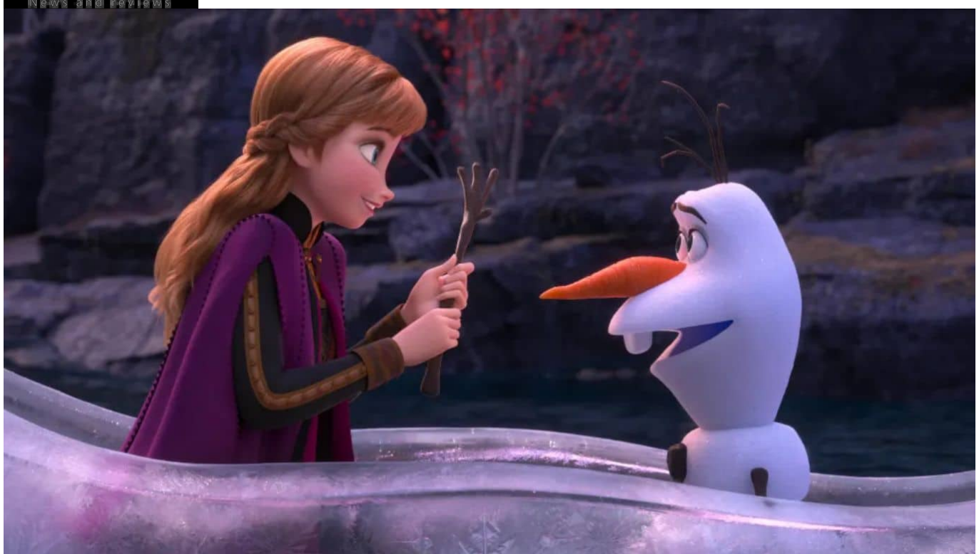
Top 10 Disney Characters whose names start with A – Anna Anna of Arendelle is a spirited young royal, marked by her undying love for her sister, Elsa. When Elsa's powers trap their kingdom in eternal winter, it's Anna's determination that drives her on a quest to mend their fractured bond.

Alongside quirky allies like Kristoff and Olaf, she faces peril with courage and learns that true love transcends romantic interest. Anna's bravery, unwavering loyalty, and genuine warmth make her an incredibly likable character, symbolizing the strength of sisterhood and familial love.