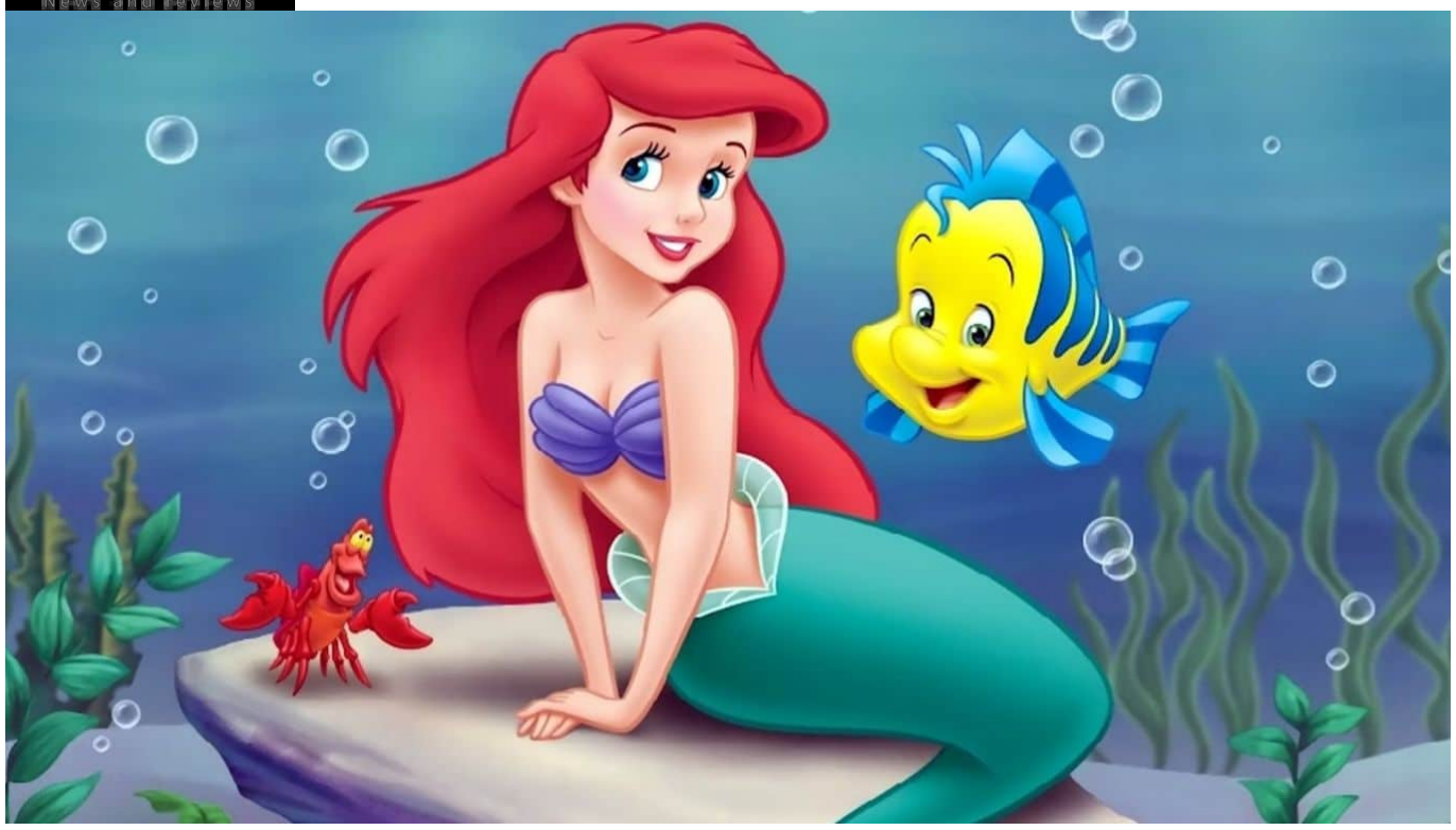
Top 10 Disney Characters whose names start with A - Ariel

Ariel of Disney's "The Little Mermaid" is a captivating blend of fiery determination and insatiable curiosity. This red-headed mermaid princess from the shimmering world of Atlantica isn't content staying in her underwater realm. Drawn to the mysteries of the human world, her adventures above and below the sea highlight her enduring spirit, courageous heart, and penchant for finding trouble.