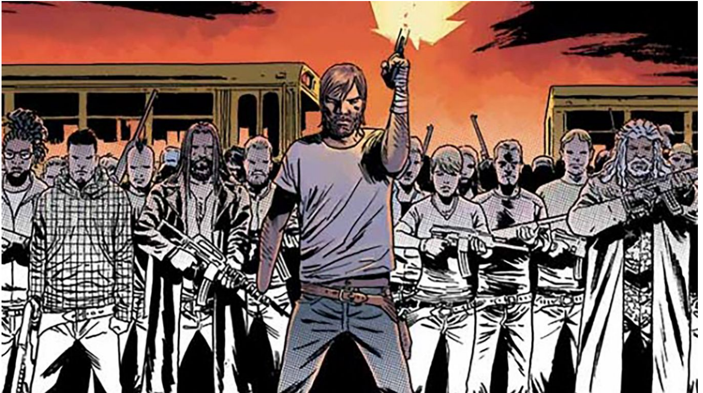
The History of Zombie Comics - The Walking Dead