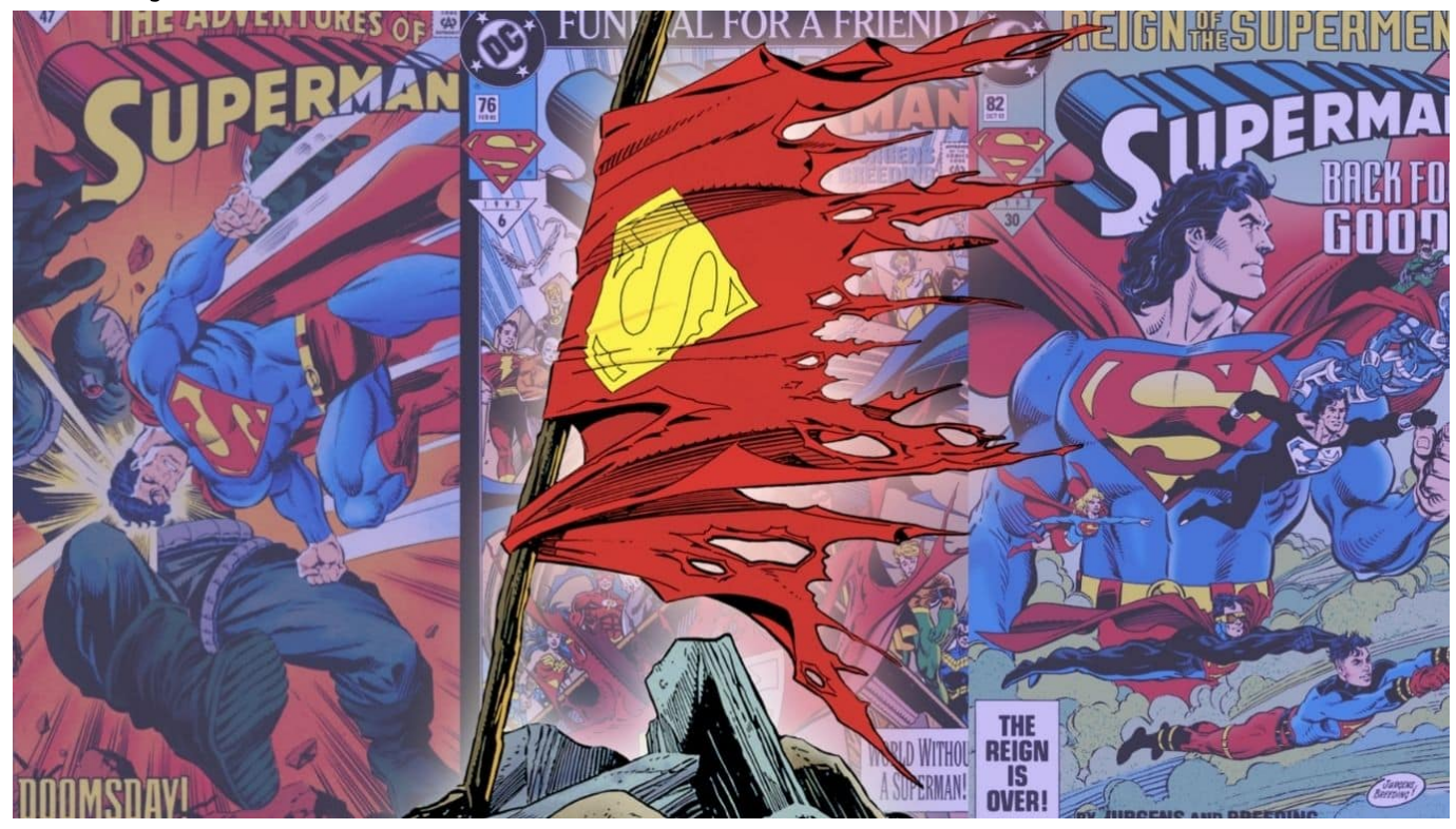
Resurrections and Reboots: How Comic Books Handle Superhero Deaths - The Cycle of Life and Death

The concept of life and death in comic books is unique. While characters may meet their demise, it is seldom permanent. Readers and fans understand that superheroes possess extraordinary abilities and often inhabit a universe where the impossible is possible. Death