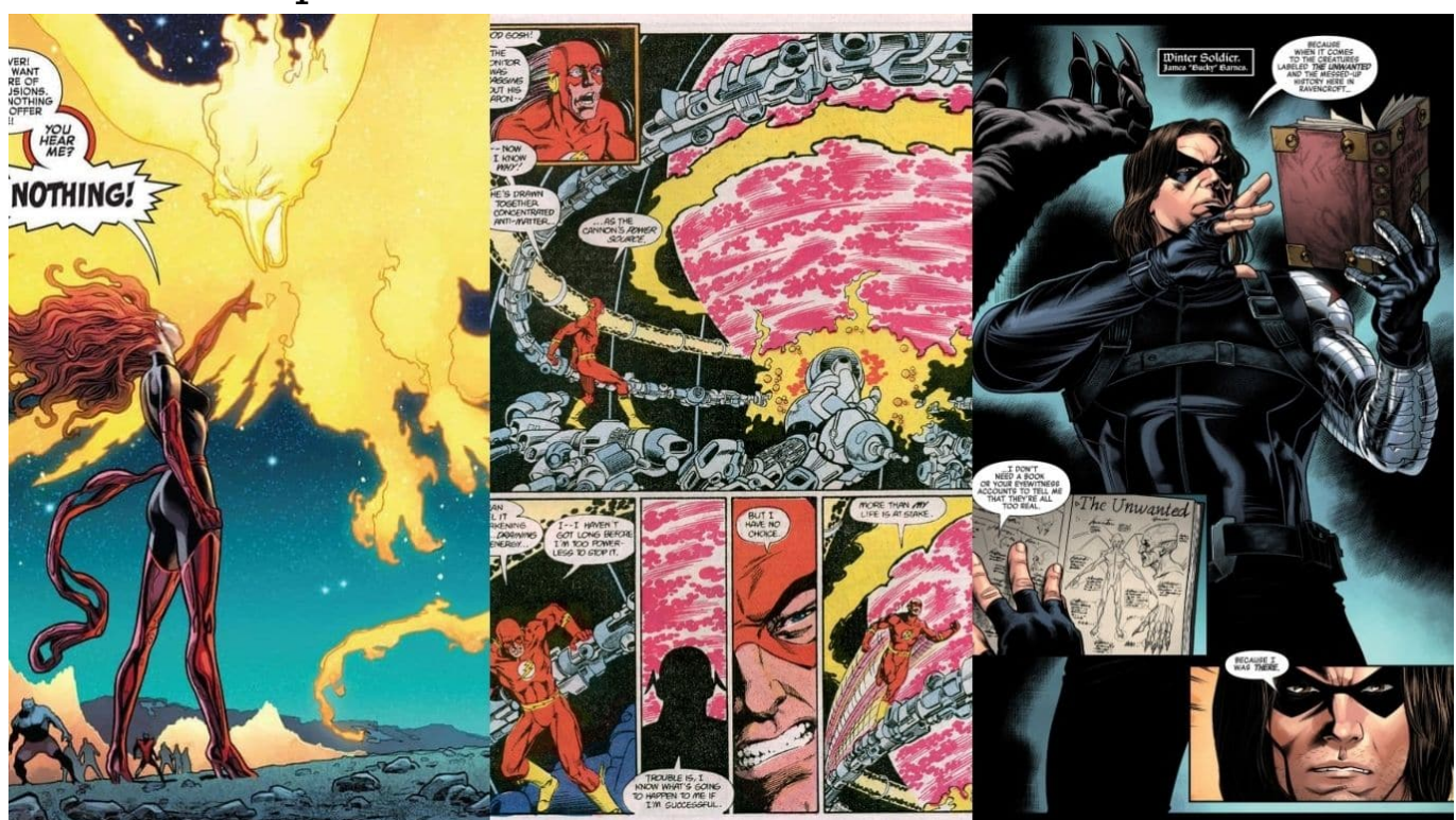
Resurrections and Reboots: How Comic Books Handle Superhero Deaths - Iconic Examples

No discussion of superhero deaths and resurrections is complete without mentioning iconic examples. These stories have left indelible marks on comic book history and continue to captivate readers and fans alike. Here are a few standout examples: