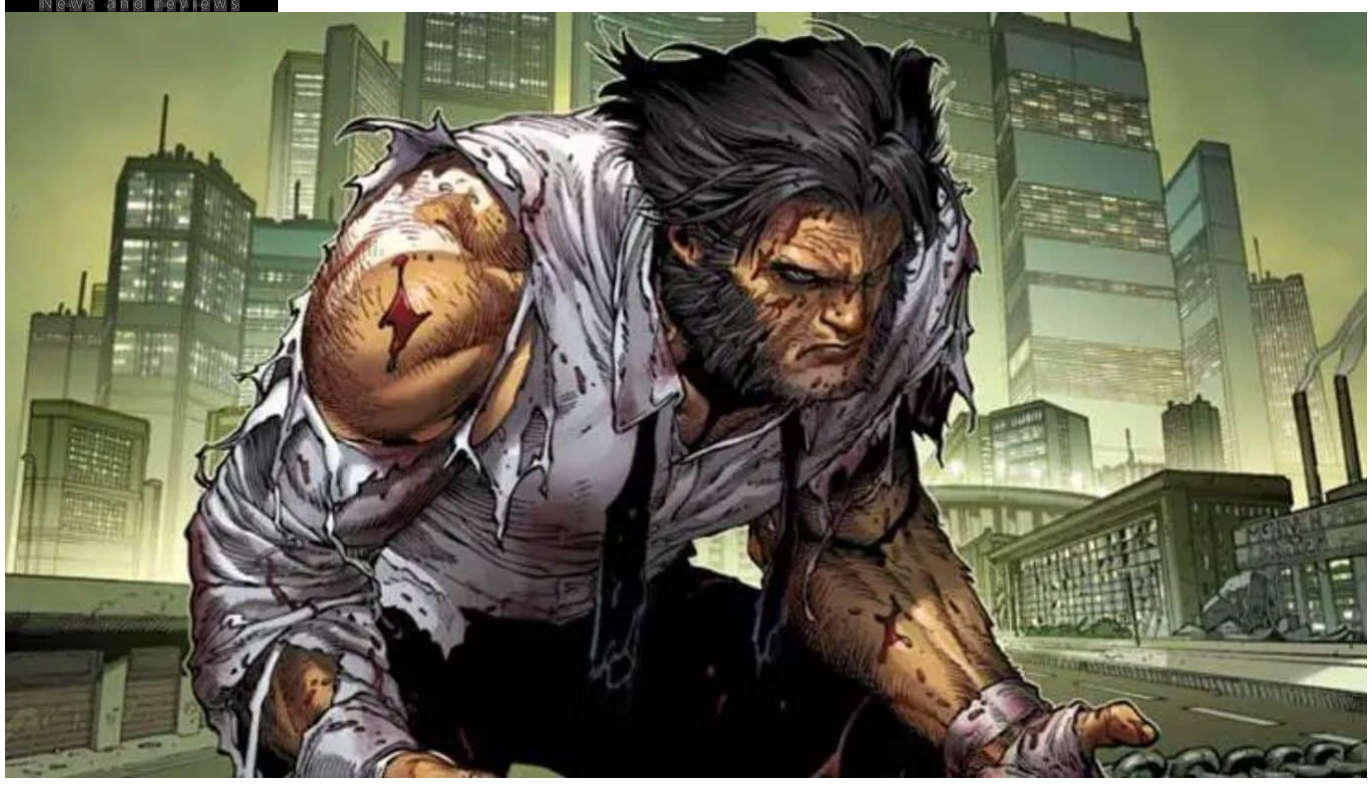
Resurrections and Reboots: How Comic Books Handle Superhero Deaths - The End or Just the Beginning?

In the world of comic books, death is not the end; it's often just the beginning of a new chapter. Superheroes may face mortality, but they also embody resilience and the enduring spirit of heroism. Their ability to bounce back from the brink of death keeps readers engaged and invested in their ongoing adventures.