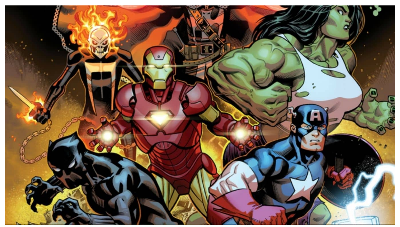
Resurrections and Reboots: How Comic Books Handle Superhero Deaths - Reboots: A Fresh Start

In addition to resurrections, comic book publishers occasionally opt for a different approach—rebooting entire universes or storylines. This creative decision allows for a fresh start, a blank canvas on which new tales can be told. The "New 52" initiative by DC Comics and Marvel's "All-New, All-Different" era are prime examples of how reboots can reshape superhero narratives.