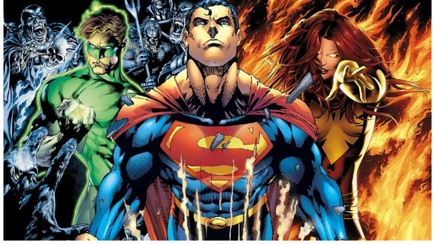
Resurrections: Back from the Beyond

One of the most common and celebrated tropes in comic books is the resurrection of superheroes. These resurrections come in various forms, each with its own unique twist. Characters like Superman, who met his demise in the iconic "The Death of Superman" storyline, have returned to the land of the living through a myriad of means.