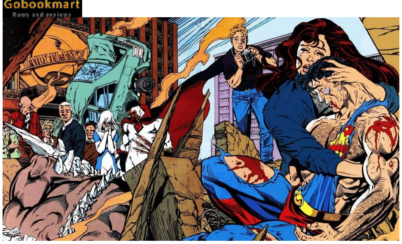
The Evolution Continues

As comic books continue to evolve, so too will the handling of superhero deaths. New generations of writers and artists will find innovative ways to explore the themes of life, death, and rebirth. Whether through resurrections, reboots, or the multiverse concept, superheroes will remain a testament to the limitless possibilities of storytelling in the comic book medium.