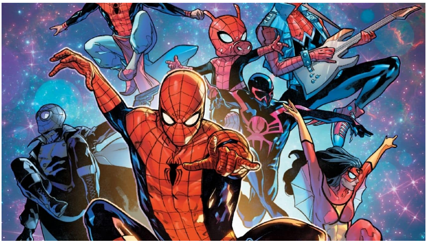
Multiverse: A Web of Possibilities

The concept of the multiverse is a fascinating and complex way to handle superhero deaths and resurrections. In a multiverse, there are multiple parallel universes, each with its own set of heroes and villains. When a character dies in one universe, they may still exist in another. This concept opens up a web of possibilities for bringing characters back to life or exploring alternate versions of them.