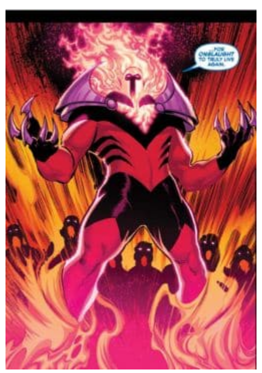
Onslaught - Phoenix's Last Hope: Multiverse Wolverines Save the Day!

"Onslaught, I presume? You weren't hiding in one person, you were hiding in all of them."