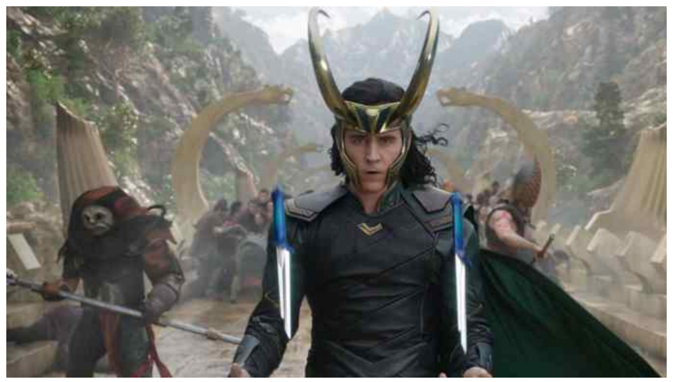
Marvel Superheroes Whose Powers Are Derived From The Gods - Loki Known as the God of Mischief in the Marvel Universe, is a complex and charismatic figure derived from Norse mythology. In the comics, he is the adopted brother of Thor and often plays the role of a trickster and an antagonist. Loki's powers include shape-shifting, illusion creation, telepathy, and magical manipulation, skills that often serve his cunning and manipulative nature.

His powers are derived from his heritage as a Frost Giant and his upbringing in Asgard, where he was trained in magic. While not necessarily granted powers by specific gods, Loki's abilities are intertwined with the divine realm of Asgard and the ancient Norse pantheon. His character embodies the intriguing duality of charm and chaos, serving as a compelling antihero and a constant challenge to the heroes of the Marvel Universe.