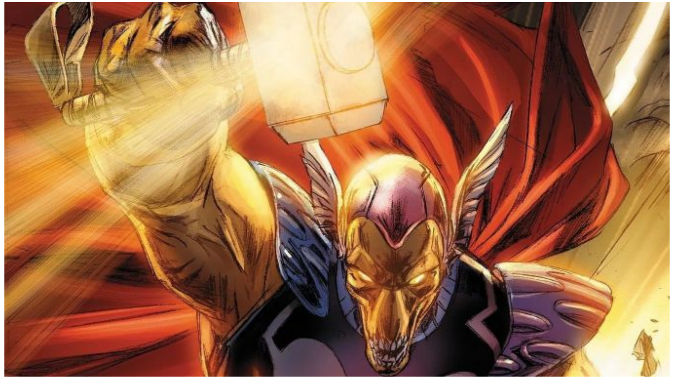
Beta Ray Bill

Ray Bill is a unique and fascinating character in the Marvel Universe. He's a member of the Korbinite race, whose entire civilization was almost wiped out. In order to protect his people, Bill was genetically and cybernetically enhanced, making him a powerful warrior.