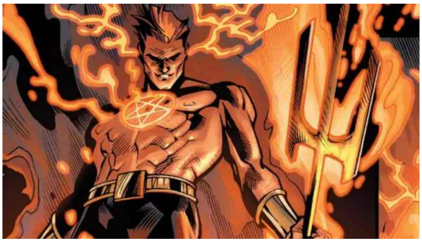
Marvel Superheroes Whose Powers Are Derived From The Gods - Hellstrom Daimon Hellstrom, also known as the Son of Satan, is a complex character in the Marvel Universe with connections to the infernal realms. Born to a human mother and the demon lord Satan, Hellstrom's heritage grants him demonic powers, including control over fire, the ability to sense evil, and immense strength.

Hellstrom's character is a constant struggle between his human compassion and his infernal nature. Trained as an exorcist and often fighting against demonic forces, he represents a balance of redemption and damnation, light and darkness.