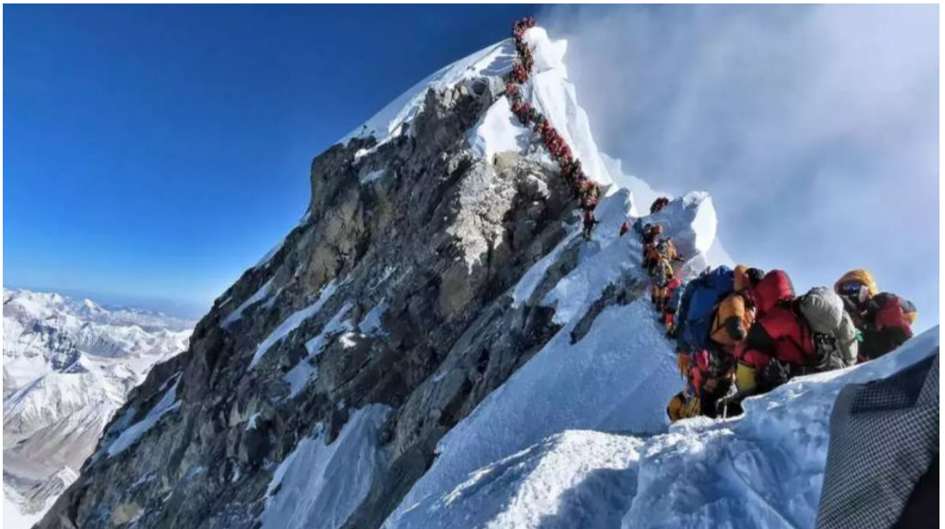
Major Historical Events on May 29 - First Ascent of Mount Everest - 1953 AD

On May 29, 1953, Edmund Hillary and Tenzing Norgay achieved the first successful ascent of Mount Everest, the world's highest peak, standing at 29,032 feet (8,849 meters).