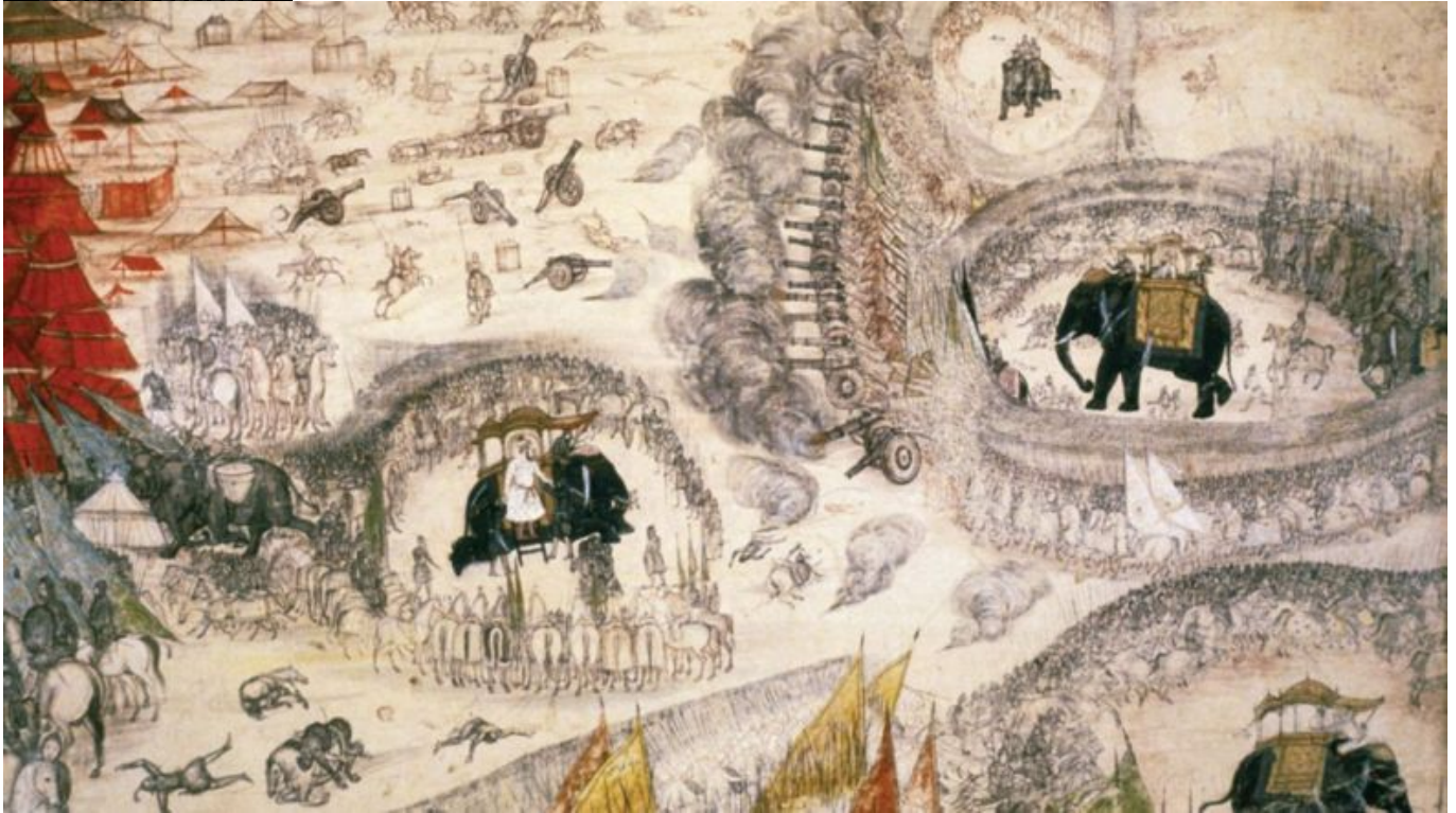
Major Historical Events on May 29 - The Battle of Samugarh - 1658 AD