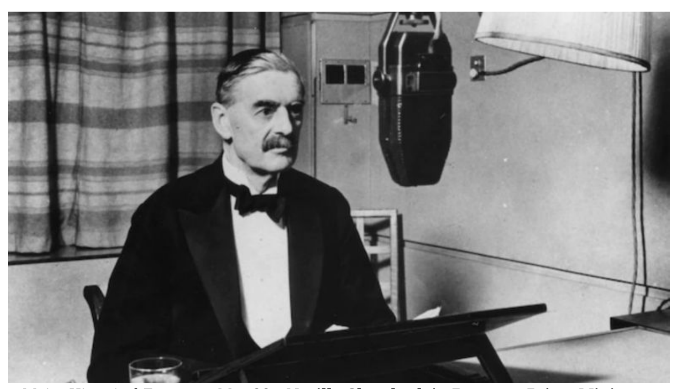
Major Historical Events on May 28 - Neville Chamberlain Becomes Prime Minister -1937 AD

In 1937, Neville Chamberlain assumed the role of Prime Minister of the United Kingdom, known for his policy of appeasement towards Nazi Germany.