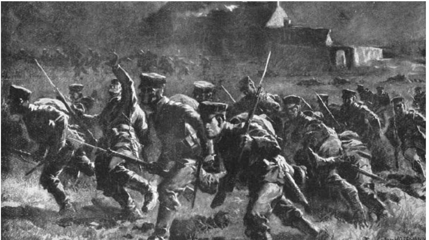
Major Historical Events on May 23 - Italy Enters World War I - 1915 AD

On May 23, 1915, Italy declared war on Austria-Hungary, joining World War I on the side of the Allies. This decision shifted the balance in the conflict and contributed to the eventual defeat of the Central Powers.