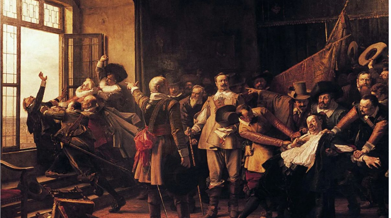
Major Historical Events on May 23 - The Defenestration of Prague - 1618 AD