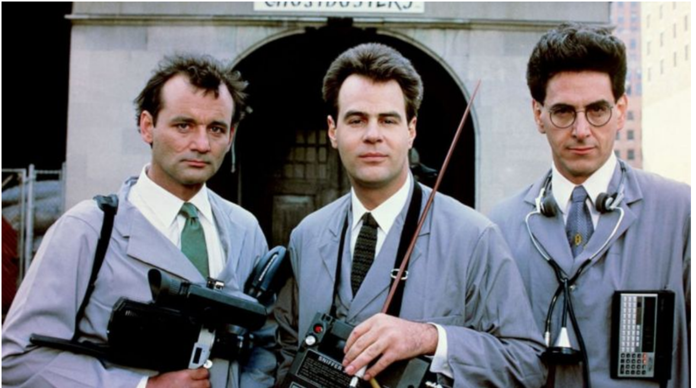
Major Historical Events on June 8 - Premiere of "Ghostbusters" - 1984 AD

"Ghostbusters," an American supernatural comedy film directed and produced by Ivan Reitman, premiered starring Bill Murray, Dan Aykroyd, Harold Ramis, and Ernie Hudson.