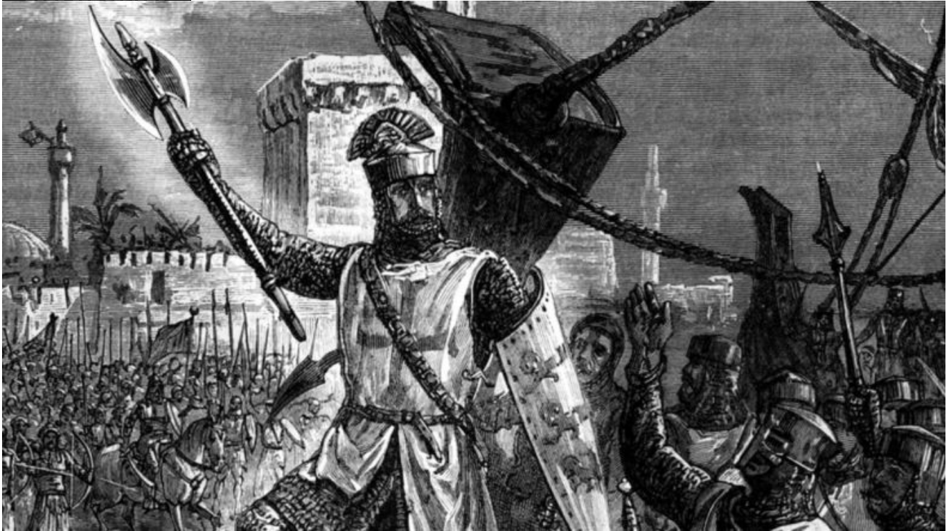
Major Historical Events on June 8 - Richard I and the Third Crusade - 1191 AD