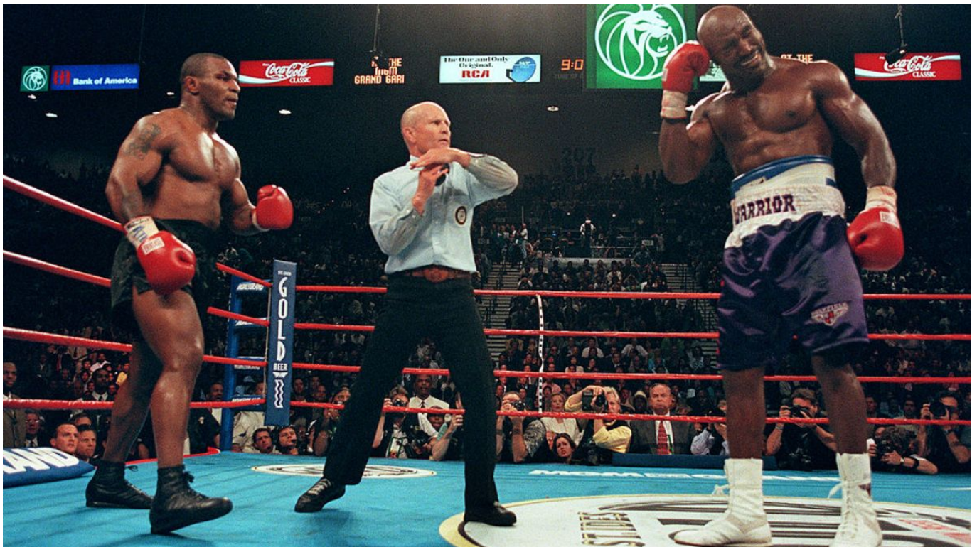
Major Historical Events on June 28 - Mike Tyson's Infamous Disqualification - 1997 AD

In a heavyweight title match, Mike Tyson was disqualified for biting Evander Holyfield's ears twice, resulting in the temporary loss of his boxing license.