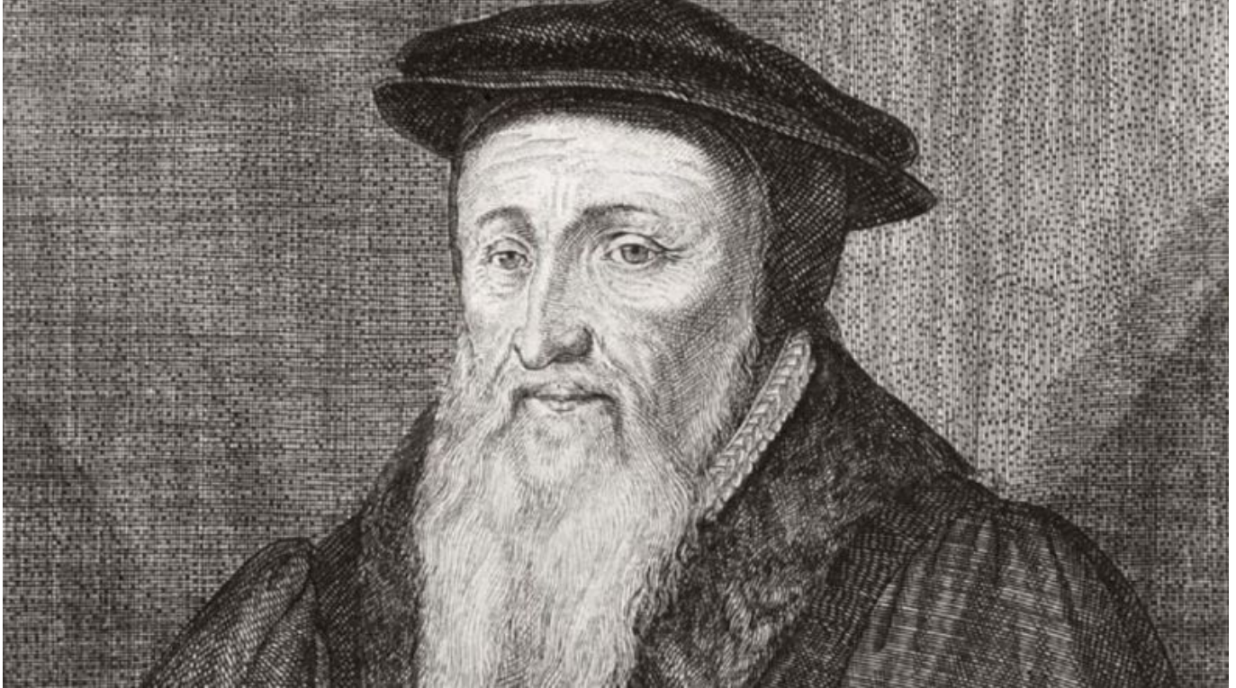
Major Historical Events on June 24 - Theodore Beza's Birth and Impact - 1519 AD