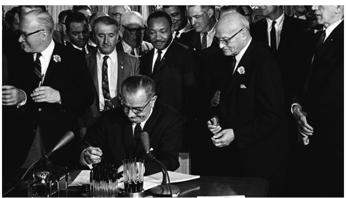
Major Historical Events on July 2 - Signing of the Civil Rights Act - 1964 AD

On this day in 1964, President Lyndon B. Johnson signed the Civil Rights Act, a landmark law that profoundly advanced the American civil rights movement.