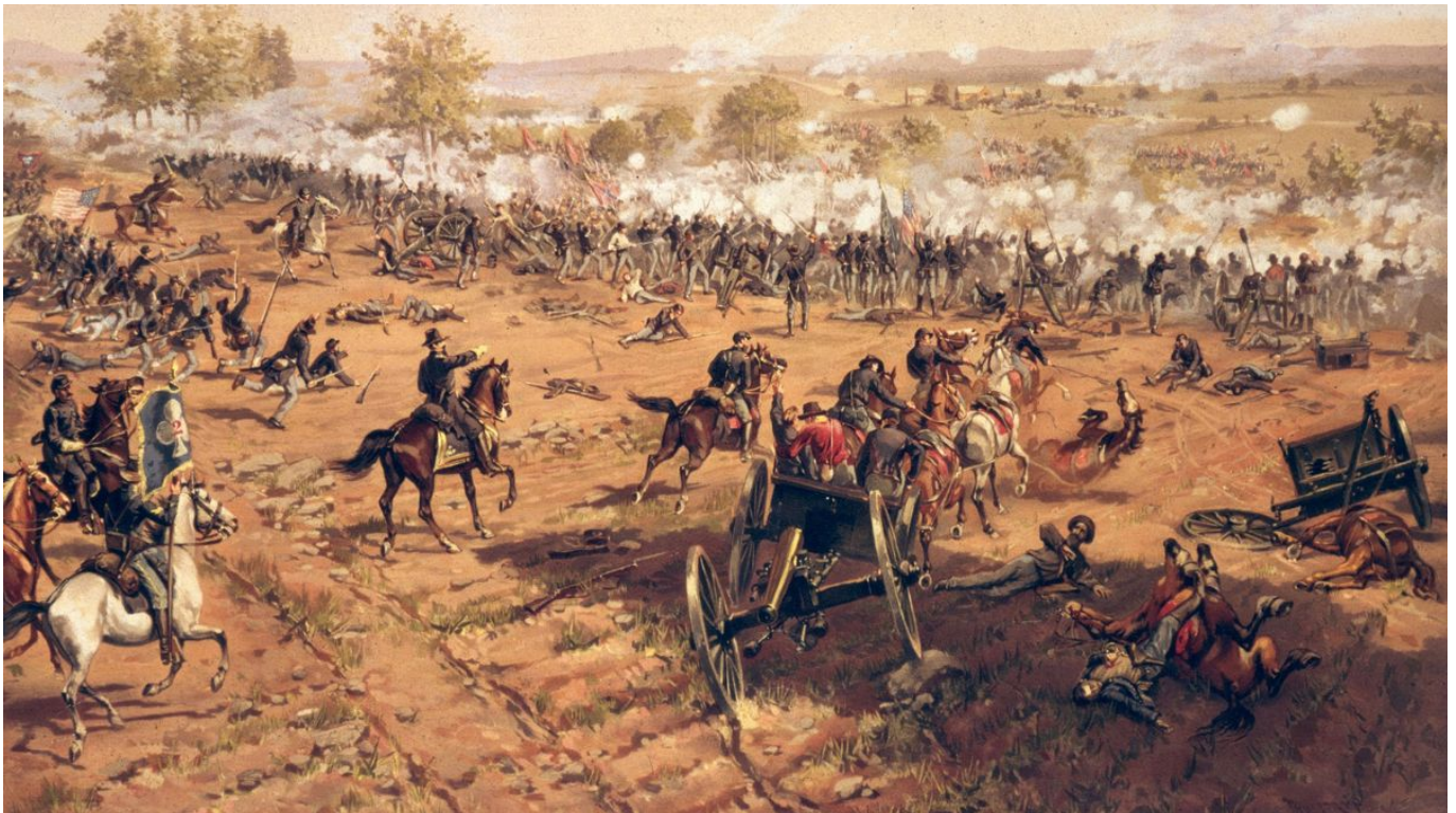
Major Historical Events on July 1 - The Battle of Gettysburg Begins - 1863 AD

The Battle of Gettysburg, which began on July 1, 1863, marked a turning point in the American Civil War. This crucial conflict ended with a decisive Union victory, significantly weakening Confederate forces.