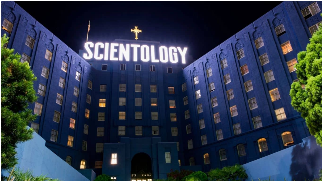
Major Historical Events on February 18- Today in History - Establishment of the