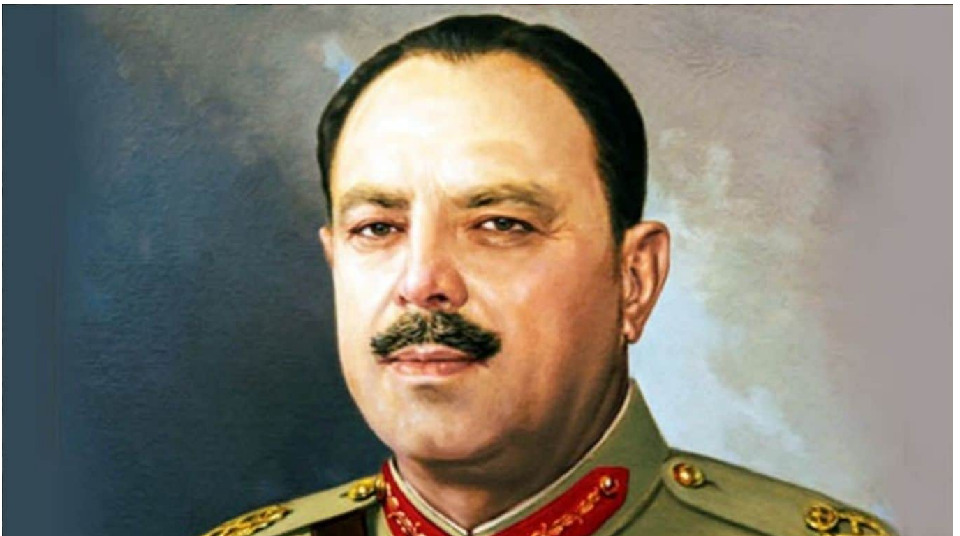
Major Historical Events on February 14- Today in History - 1960: Marshal Ayub