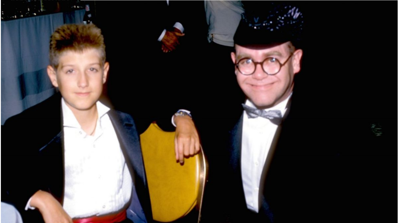
Major Historical Events on April 8 - A Young Hero's Legacy - 1990 AD