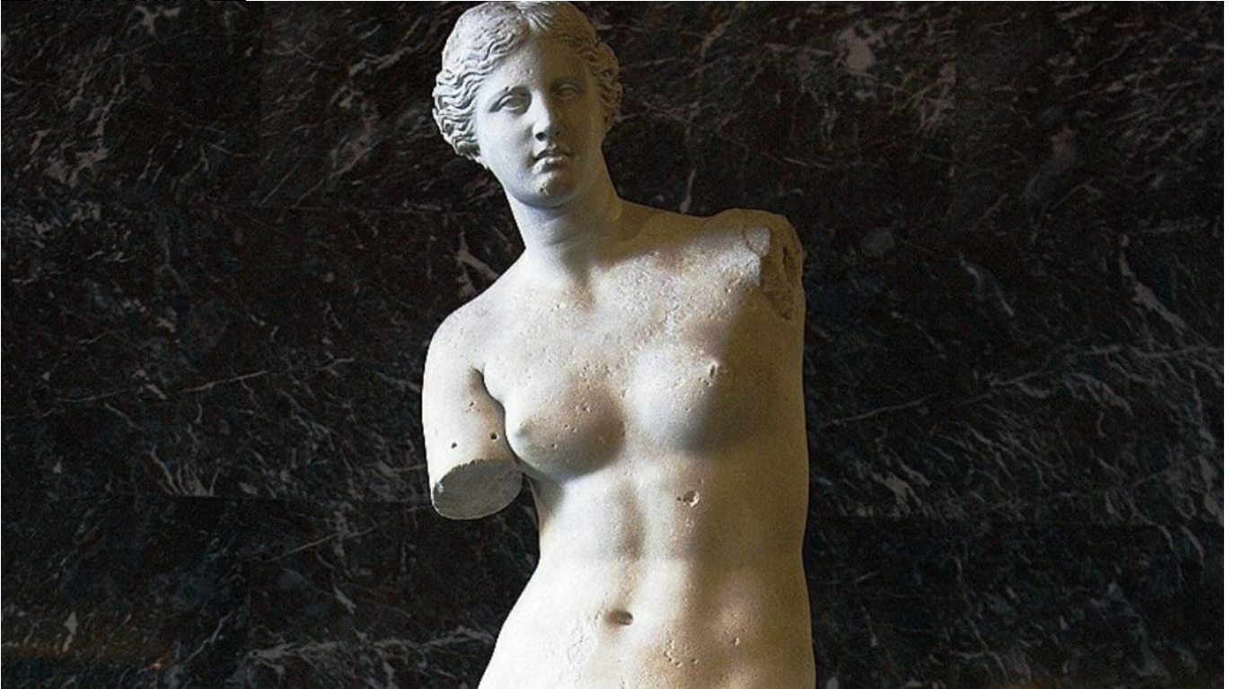
Major Historical Events on April 8 - Unearthing Beauty from Antiquity - 1920 AD