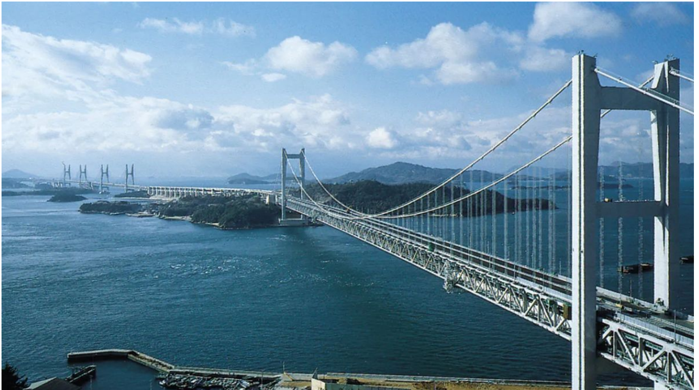
Major Historical Events on April 10 - Bridging Seas: The Opening of the Seto Great Bridge - 1988 AD

After a decade of construction, the Seto Great Bridge, which spans the Inland Sea in Japan, was inaugurated, enhancing connectivity and infrastructure.