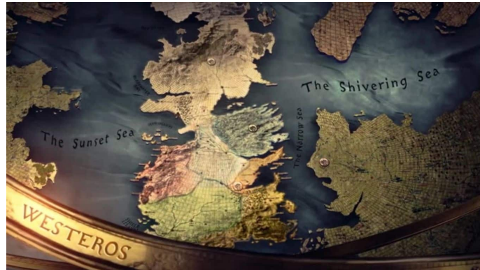
Westeros - The Song of Ice and Fire

The land on which George R R Martin's wondrous series, The Song of Ice and Fire, unfolds is truly breath-taking. It is perhaps one of the modern marvels of fantasy, and perhaps the only modern fantasy world comparable to Tolkien's creations. This stretches and spans the entire earth and includes snowscapes, deserts, coastal and port towns and forts too. It has a miraculous breadth and length. It's so firmly constructed that it almost feels real.