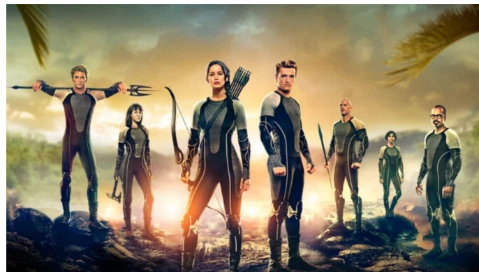
Fictional Worlds Every Book Lover Would Love to Visit - Panem - Hunger Games trilogy

Well, no one in their right minds would want to be a part of Panem, the fictional world in Suzanne Collins’s Hunger Games trilogy. But it sure would be fun to visit. Panem consists of thirteen districts headed by a Capitol, which is the administrative and political centre. Each of the first twelve districts have an occupation they excel at, and the thirteenth district lies