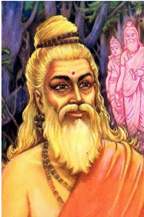
Famous Gurus from Hindu Mythology (Indian Mythology) - Guru Vishwamitra

Guru Vishwamitra - a powerful rishi who was the guru of Lord Rama and was instrumental in helping Rama defeat the demon king, Ravana