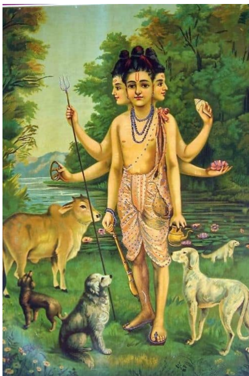
Famous Gurus from Hindu Mythology (Indian Mythology) - Dattatreya

Dattatreya is a prominent figure in Hindu mythology, and is considered to be an incarnation of the divine Trinity - Brahma, Vishnu, and Mahesh. He is known for his wisdom and knowledge, and is revered as a guru to many sages and saints.