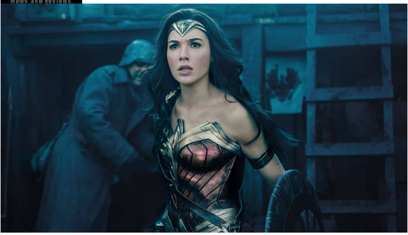
DC Superheroes Whose Powers Are Derived From The Gods - Wonder Woman A warrior princess of the Amazons, she was sculpted from clay by her mother and given life by Greek deities. Endowed with the strength of Hercules, the wisdom of Athena, and the speed of Hermes, she embodies the virtues and powers of the gods. Wonder Woman's character is defined by her unbreakable spirit and unwavering commitment to justice. Armed with her Lasso of Truth, bracelets, and sword, she fights for peace in both the mortal world and the mythical realm. Her timeless appeal transcends generations, making her a beloved icon of empowerment and heroism.