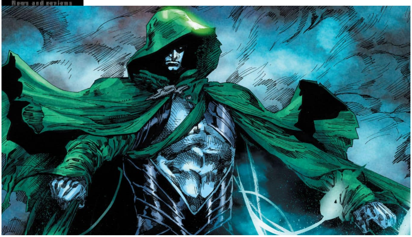
DC Superheroes Whose Powers Are Derived From The Gods - Spectre

Often depicted as the literal Wrath of God, The Spectre is an otherworldly entity charged with exacting divine vengeance upon those who have committed evil deeds. This supernatural being has the ability to manipulate time, space, and reality, wielding power on a cosmic scale. The Spectre's human host, usually a deceased individual such as police detective Jim Corrigan, serves as a grounding element, guiding the relentless pursuit of justice. The combination of divine mission and human empathy creates a complex and compelling character. Through the eyes of The Spectre, readers explore profound themes of morality, redemption, and the eternal struggle between good and evil.