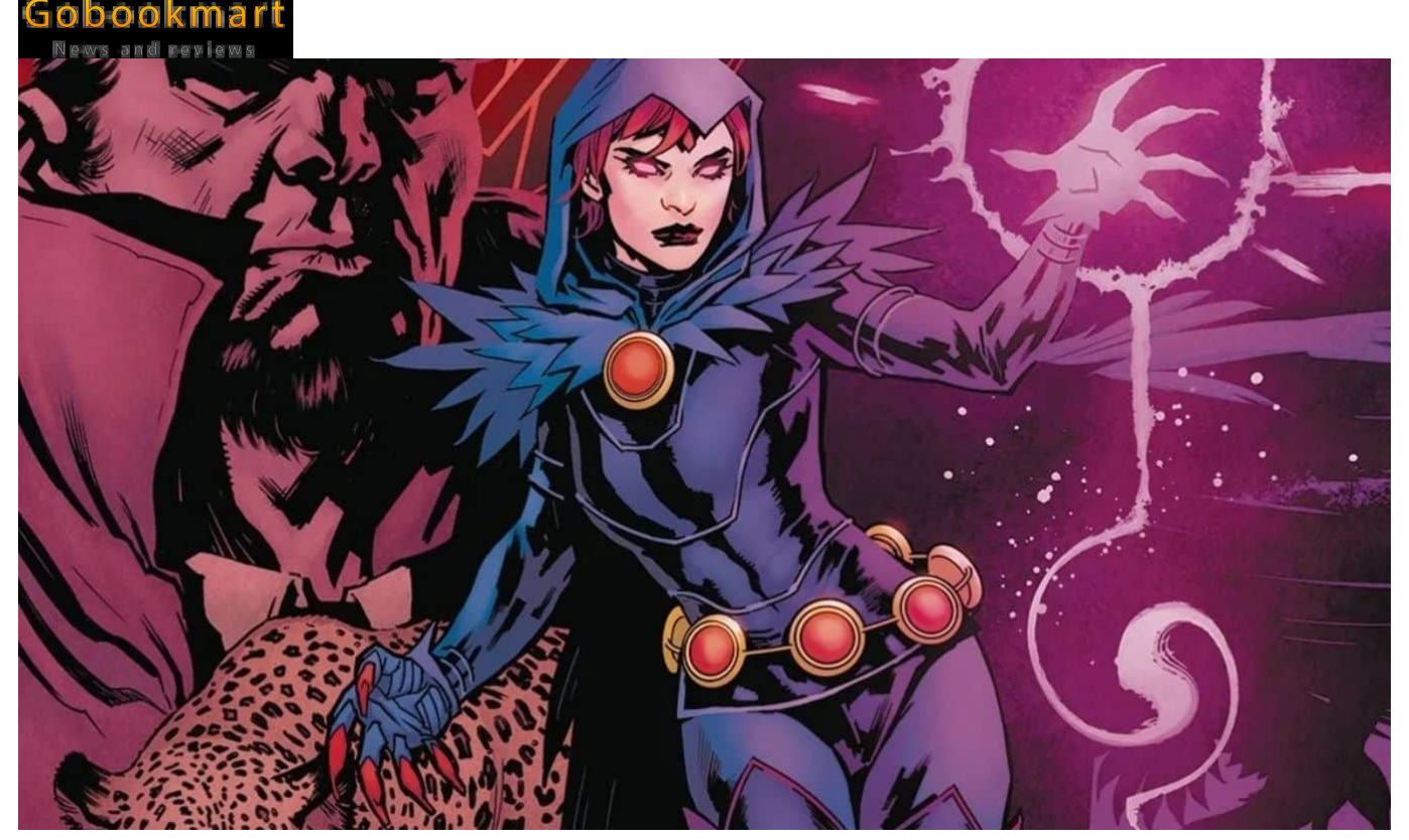
DC Superheroes Whose Powers Are Derived From The Gods - Raven

With a mystical and complex background, Raven's powers are deeply tied to her emotions and include telepathy, empathy, teleportation, and magical abilities. A long-time member of the Teen Titans, she often struggles to balance her demonic lineage with her desire to do good. Raven's character represents a fascinating blend of supernatural lore and human vulnerability, as she continuously battles both external enemies and her inner demons. Her mystical connection to the otherworldly adds depth to the universe of DC superheroes, making her a standout character.