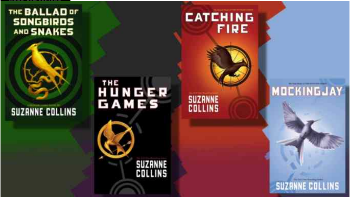
The Hunger Games series

In a dystopian future where society is divided into districts, readers witness the journey of a strong-willed protagonist as she volunteers to take her sister's place in a brutal televised event known as The Hunger Games. What unfolds is a gripping tale of survival, rebellion, and societal injustice, where the stakes are life and death. Through the protagonist's eyes, the series explores themes of power, resistance, and the effects of violence, while also delving into the complexities of human nature and morality. The fast-paced plot, coupled with its thought-provoking commentary on society, makes this series a compelling read that resonates with readers long after the final page is turned.