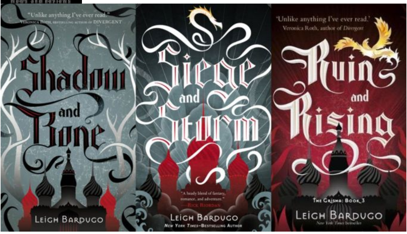
The Grisha Trilogy

A dark and immersive fantasy world comes to life in the Grisha Trilogy, where readers are introduced to a war-torn land filled with magic, mystery, and complex political intrigue. The story follows a young orphan girl who discovers she has a unique power that could be the key to saving her world from destruction. As she trains with the Grisha, a group of magical elite soldiers, she uncovers dark secrets and faces dangerous enemies who threaten to tear her world apart. With its richly developed characters, intricate plot, and immersive worldbuilding, the Grisha Trilogy is a captivating read that will leave fans of the fantasy genre wanting more.