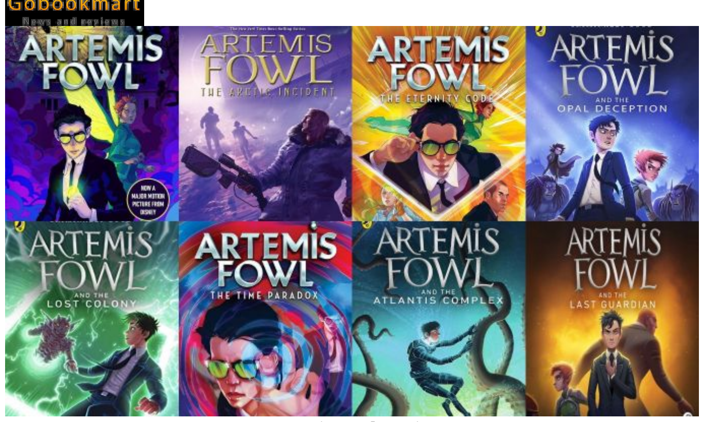
Artemis Fowls series

A young criminal mastermind, Artemis Fowl II discovers the existence of fairies and other magical creatures and hatches a plan to restore his family's wealth by kidnapping a fairy for ransom. As Artemis delves deeper into the magical world, he confronts his own morals and beliefs, ultimately questioning the path he has chosen. The witty writing, fast-paced plot, and complex characters, particularly Artemis, make this series a standout in the fantasy genre. With a rich and immersive world filled with technology and magic, and a diverse cast of characters, the Artemis Fowl series captivates readers young and old alike.