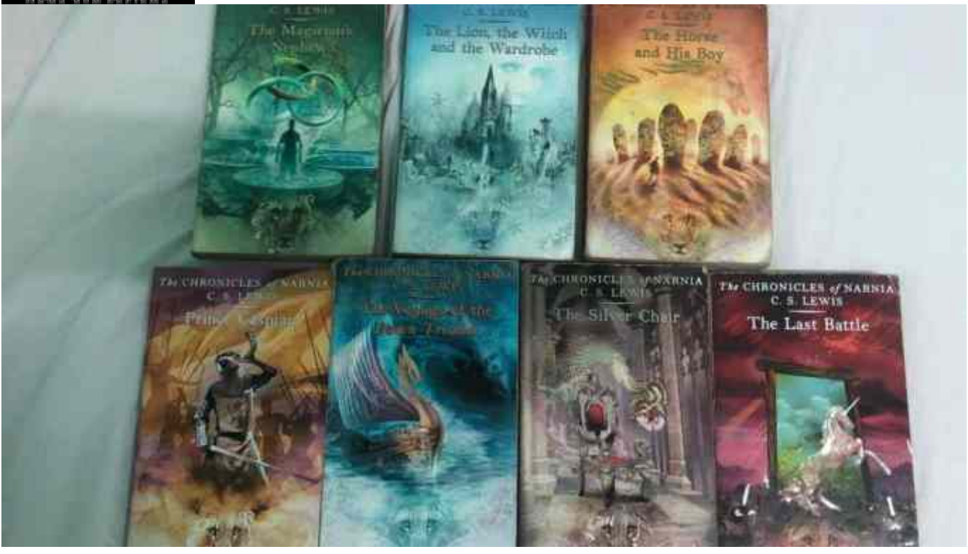
The Chronicles of Narnia series

A magical world filled with talking animals, mythical creatures, and epic battles between good and evil awaits readers in this classic series. As they follow the adventures of the Pevensie siblings in the land of Narnia, they'll witness their alliance with the noble lion, Aslan, and their fight against the forces of the White Witch and other villains. Along their journey, they learn valuable lessons about courage, faith, and redemption. Timeless in its appeal and rich with allegorical meaning, this series has captivated generations and remains a cornerstone of the fantasy genre.