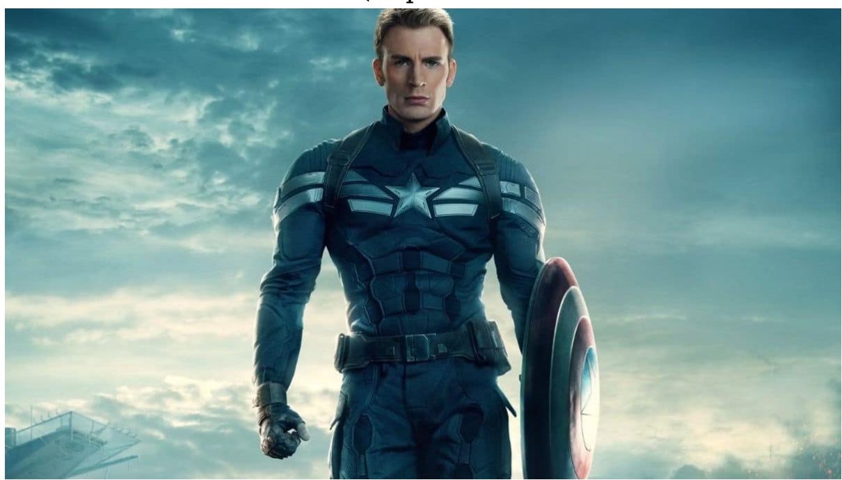
Captain America's Stealth Suit (Captain America: The Winter Soldier)

The stealth suit's design takes a departure from the vibrant colors and patriotic symbolism of Captain America's traditional uniform. Instead, it embraces a more muted color palette, featuring shades of navy blue and dark gray. This shift in aesthetics aligns with the film's themes of espionage, secrecy, and the discovery of a hidden enemy within S.H.I.E.L.D. The suit's tactical functionality allows Captain America to blend into the shadows and navigate covert operations with greater ease.