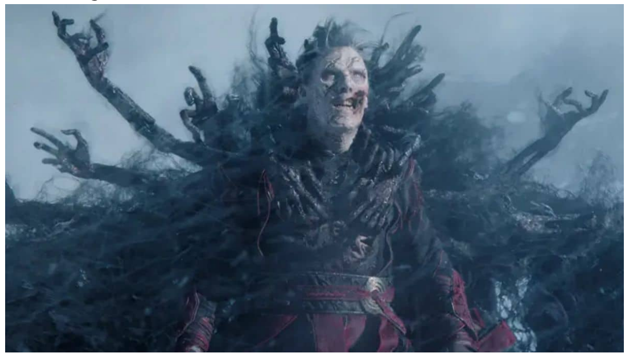
Best Costume Upgrades in the Marvel Cinematic Universe - Doctor Strange (The Multiverse Of Madness)

Stephen Strange's iconic blue sorcerer robes and red cape have become synonymous with his character throughout his appearances in the Marvel Cinematic Universe. However, in his new movie "Doctor Strange in the Multiverse of Madness," fans show a surprising twist as the Sorcerer Supreme dons a brand-new costume.