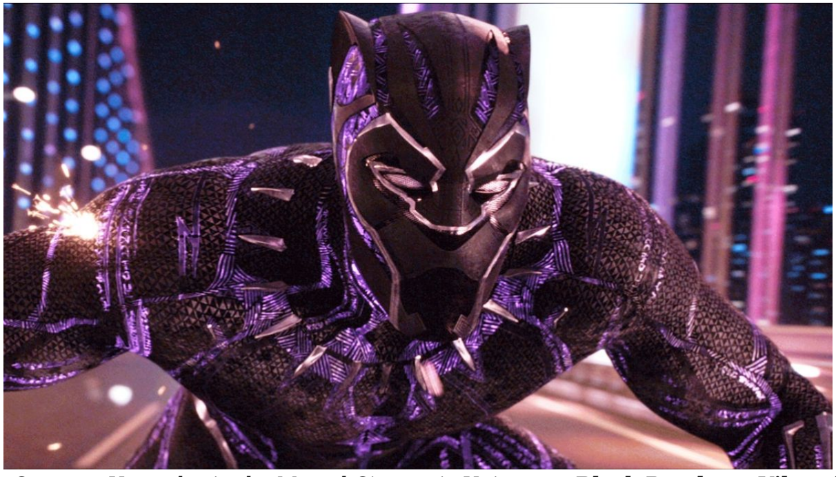
Best Costume Upgrades in the Marvel Cinematic Universe - Black Panther - Vibranium Suit (Black Panther)

Black Panther - Vibranium Suit (Black Panther)