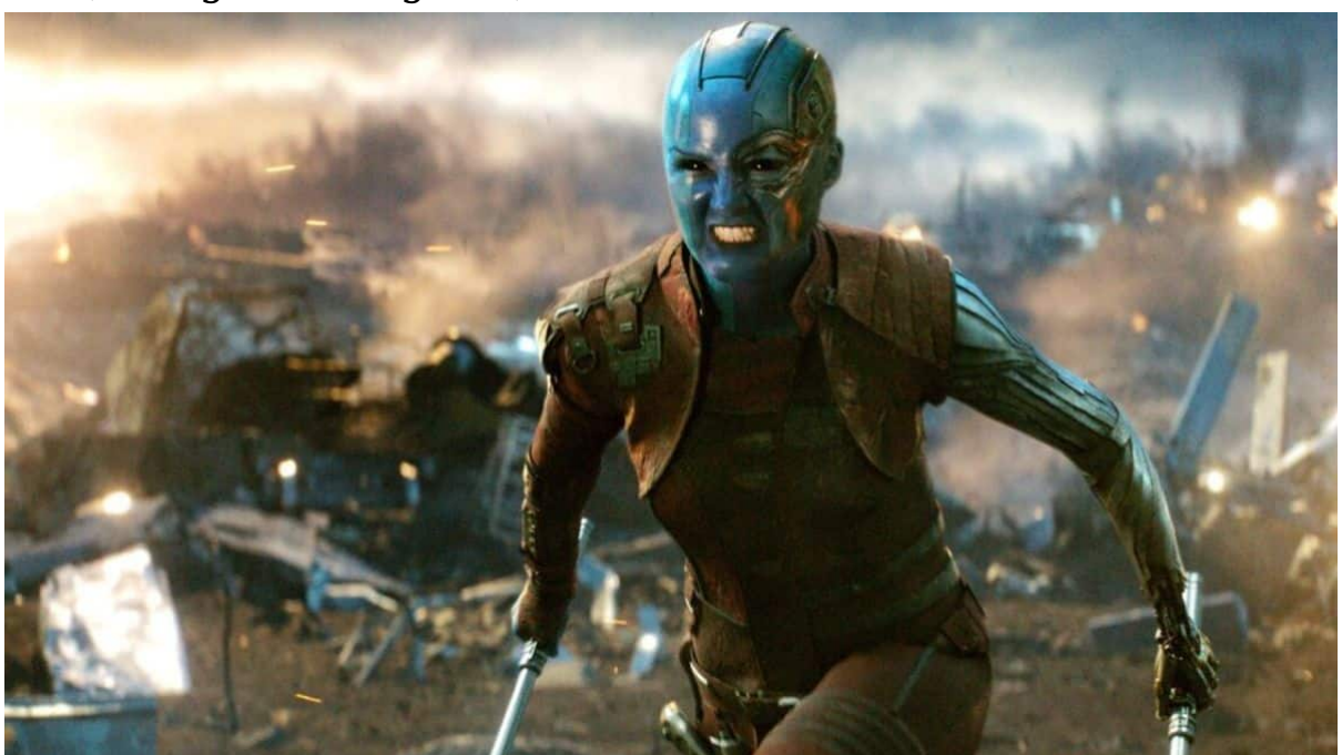
Best Costume Upgrades in the Marvel Cinematic Universe - Nebula (Avengers: Endgame)

Nebula, a complex character in the Marvel Cinematic Universe, started off as one of the