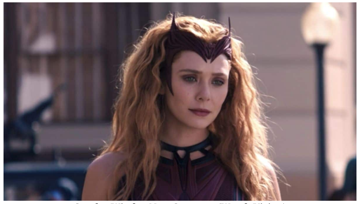
Scarlet Witch - New Costume (WandaVision)

The previous costumes worn by Scarlet Witch were more practical and tactical in nature, aligning with her role as an Avenger. They typically featured a combination of red, black, and leather materials. While these costumes served their purpose, they didn't fully embody the magical and mystical nature of Wanda's powers.