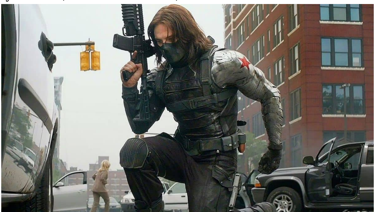
Best Costume Upgrades in the Marvel Cinematic Universe - Bucky Barnes (The Winter Soldier)

In his first appearance in "Captain America: The First Avenger," Bucky dons a traditional