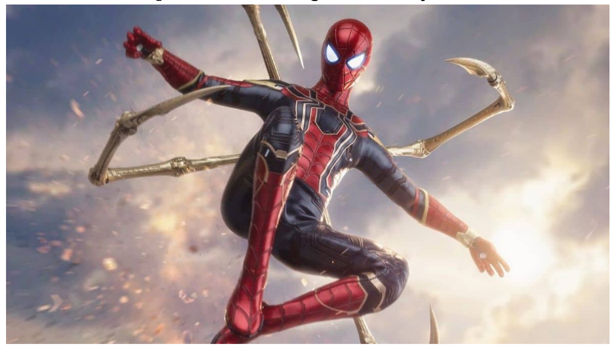
Best Costume Upgrades in the Marvel Cinematic Universe - Spider-Man's Iron Spider Suit (Avengers: Infinity War)

Spider-Man's Iron Spider Suit (Avengers: Infinity War)