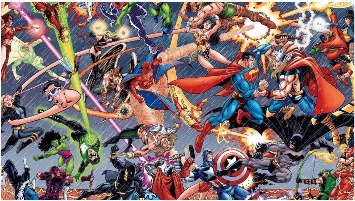
Aspects Where DC Outshines Marvel

The concept of the "Multiverse" has been integral to the DNA of DC Comics for decades. While both Marvel and DC have delved into the idea of multiple realities and alternate universes, DC is often credited with pioneering and more deeply exploring the Multiverse concept. Here's a closer look at DC's engagement with the Multiverse: