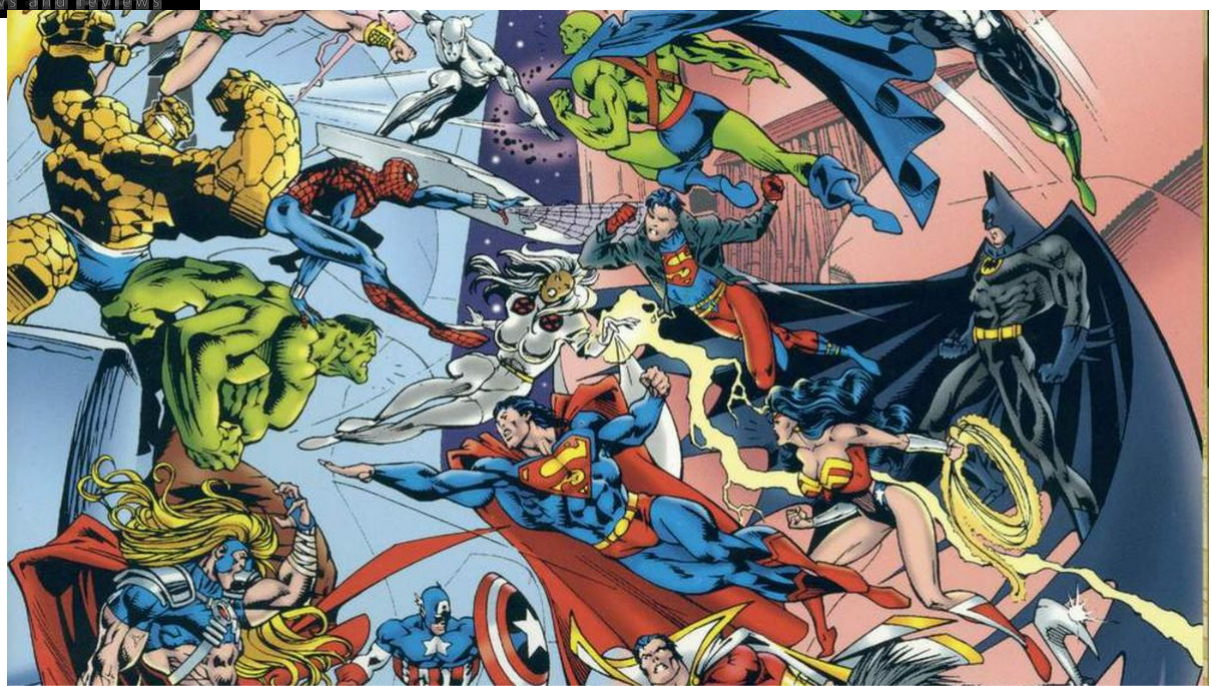
Aspects Where DC Outshines Marvel