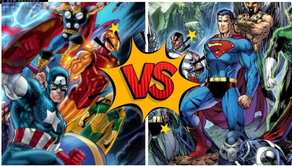
Aspects Where DC Outshines Marvel