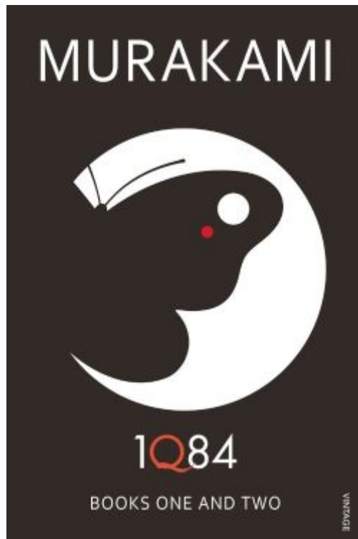
7 Best Books by Haruki Murakami - 1Q84