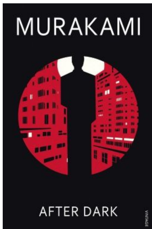
7 Best Books by Haruki Murakami - After Dark