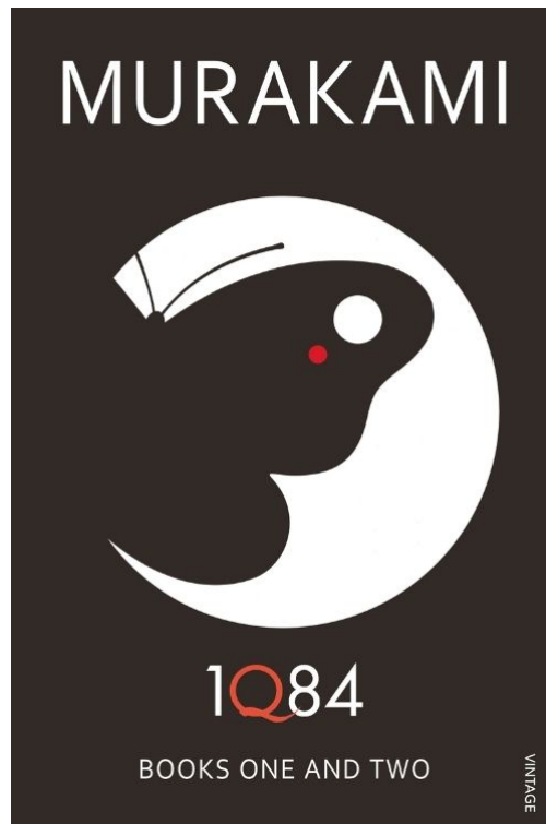
7 Best Books by Haruki Murakami - 1Q84