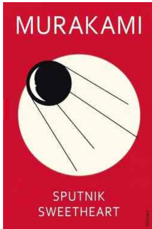
7 Best Books by Haruki Murakami - Sputnik Sweetheart