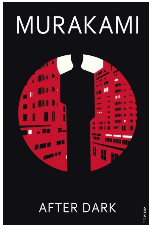
7 Best Books by Haruki Murakami - After Dark