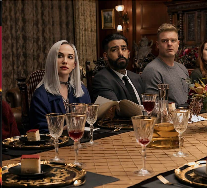
5 Most Searched Movies on Internet in October 2023 - The Fall of the House of Usher

“House of Usher,” originally titled “The Fall of the House of Usher,” takes the first spot on our list and might come as a shock to many. This 1960 classic, approved with a runtime of 1 hour and 19 minutes, has re-emerged in the public eye, partially due to the success of a mini-series based on the famous book by Edgar Allan Poe, available on Netflix. This curiosity has brought people to Google in search of more information, leading them to this vintage gem.