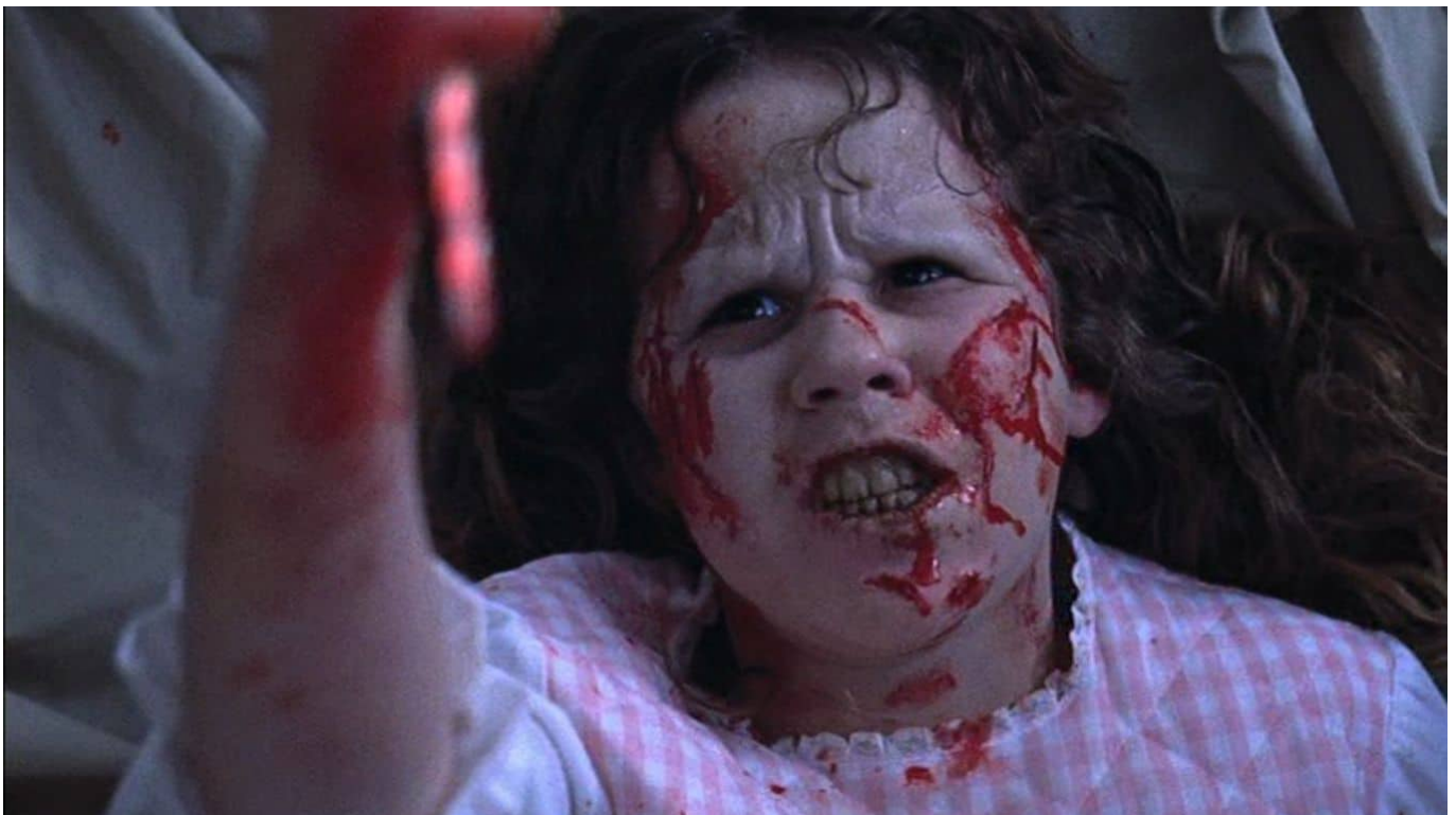
5 Most Searched Movies on Internet in October 2023 - The Exorcist (1973)

“The Exorcist” franchise has been one of the most iconic in the horror genre, with its intense and unsettling storytelling captivating audiences since the release of the first film in