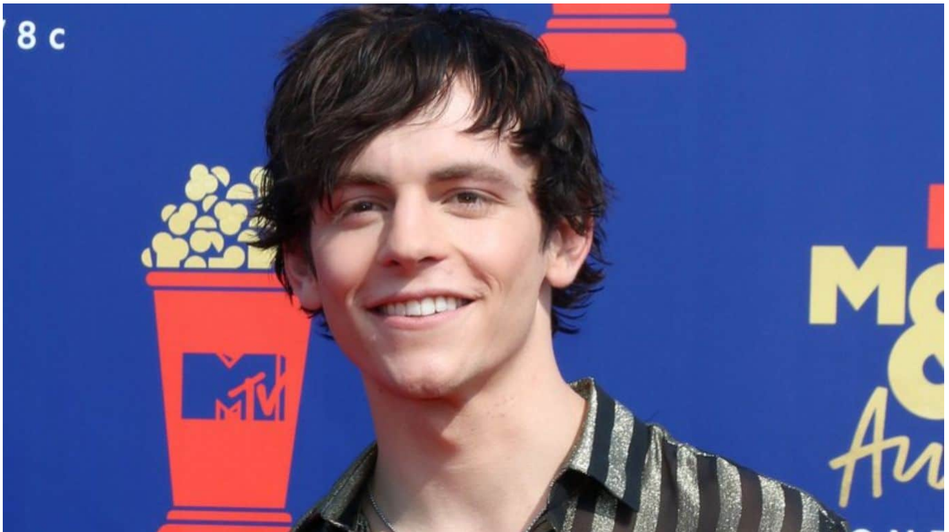
5 Actors Perfectly Suited to Be the Next Flash In DC Movies - Ross Lynch

Ross Lynch was born on December 29, 1995, in Littleton, Colorado, and began his career as a child actor, showcasing his abilities in both acting and music at an early age. Lynch rose to prominence through his roles in various Disney Channel productions, including the lead role in the hit series “Austin & Ally.”