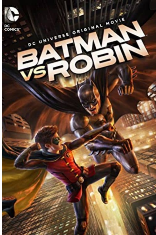
Batman vs. Robin

The existing DC Animated Movie Universe has Damien Wayne as a blot. Damien becoming a significant part of the canon is difficult given that Batman is already present in 4 of every 5 movies, which is already taxing. Due to the fact that Damien is the child of Talia al Ghul and Bruce Wayne, he naturally inherited many amazing skills from both of his parents in terms of intellect, strength, and spirit. He has a lot of redeemable characteristics, but he's also very pompous and unlikeable. The main character is unlikable and dull, the plot is formulaic, and the adversarial force is underutilized, therefore the movie lacks excitement.