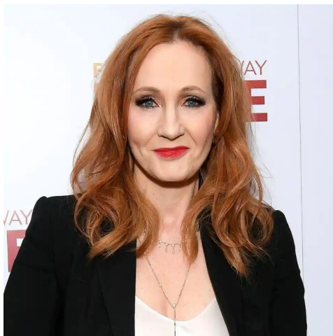
10 Real-Life Examples of Never Giving Up - J K Rowling

It is hard to believe that Rowling's first Harry Potter novel got rejected 12 times. She was even suggested "not to quit her day job." Even her recent anonymously penned novels