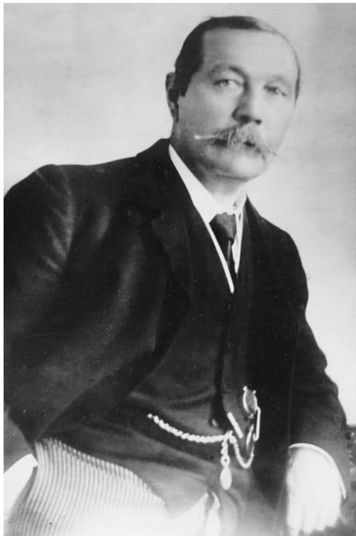
Arthur Conan Doyle

Sir Arthur Conan Doyle, born in 1859 in Edinburgh, Scotland, was a prolific British author best known for his creation of the iconic fictional detective, Sherlock Holmes. Doyle's literary career spanned various genres, but it was his detective stories that earned him enduring fame and a permanent place in the annals of literature.