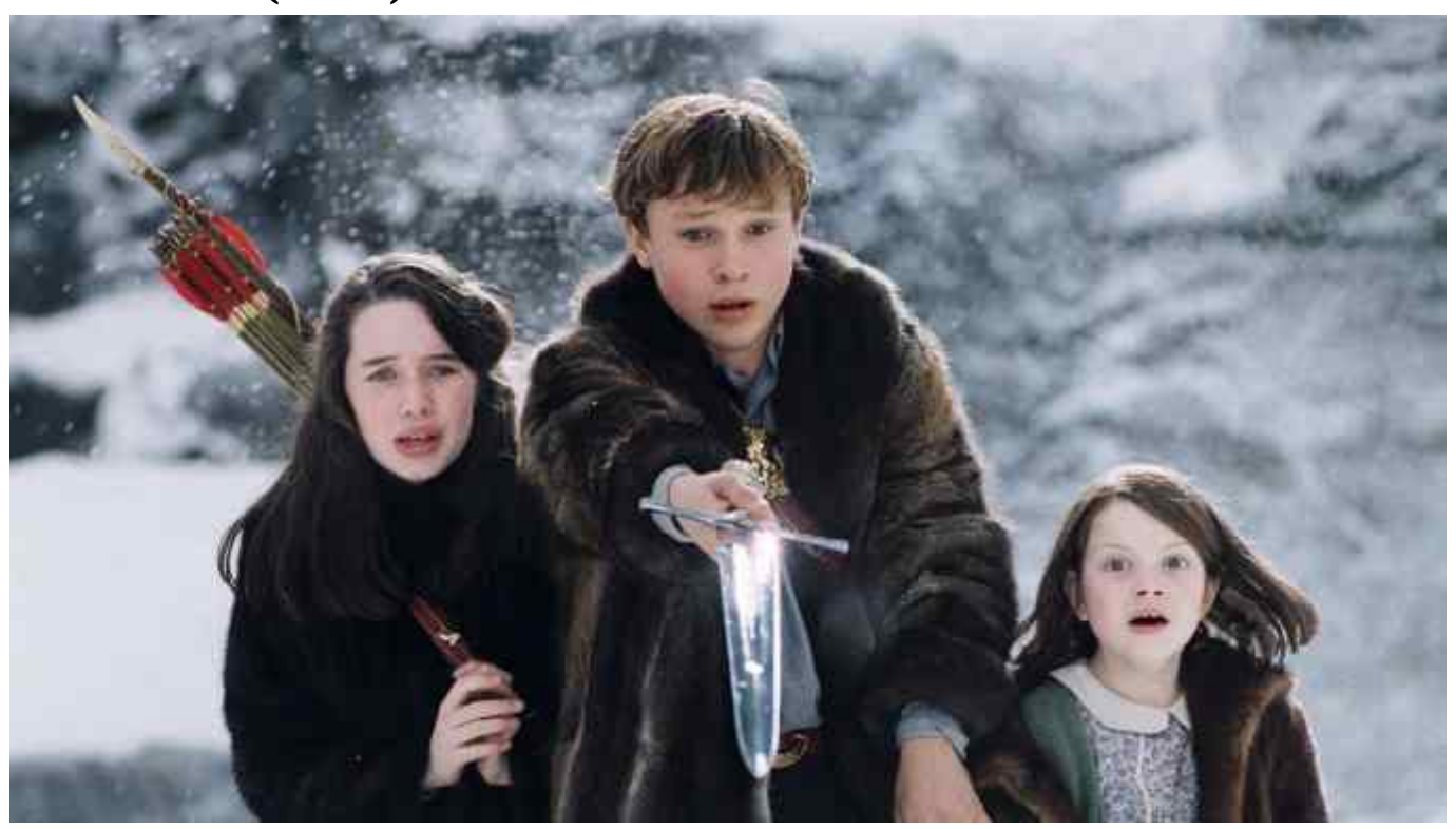
10 Movies Featuring The 'Chosen One' Theme - "The Chronicles of Narnia: The Lion, the Witch, and the Wardrobe" (2005)

And coming in at number eight is the magical world of Narnia from "The Chronicles of Narnia: The Lion, the Witch, and the Wardrobe." When the Pevensie siblings, Peter, Susan, Edmund, and Lucy, stumble through a wardrobe, they find themselves in the fantastical world of Narnia, a place where animals talk, magic is real, and an epic battle between good and evil is unfolding.