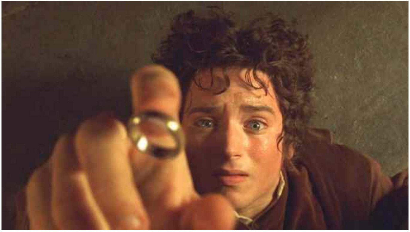
10 Movies Featuring The 'Chosen One' Theme - "The Lord of the Rings: The Fellowship of the Ring" (2001)

Now we take a stroll into the mystical realm of Middle-earth with the epic tale of "The Lord of the Rings." Frodo Baggins, a small but mighty hobbit, is handed the monumental task of trekking across treacherous lands to Mount Doom in order to destroy the One Ring and save the world from the dark clutches of Sauron.