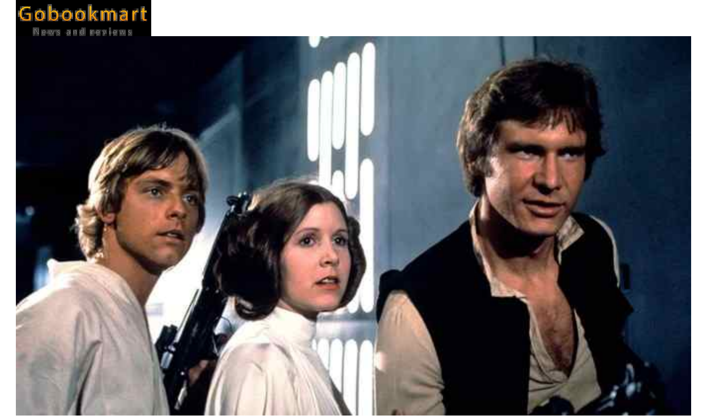
"Star Wars: A New Hope" (1977)

And kicking off our cinematic exploration, we've got none other than the classic that took us to a galaxy far, far away - "Star Wars: A New Hope". This epic space opera introduced us to the young and unassuming Luke Skywalker, whose life takes a dramatic turn when he crosses paths with a droid carrying a distress message from Princess Leia. Guided by the wise and mysterious Obi-Wan Kenobi, Luke discovers the mystical world of the Force, a power that's not your average run-of-the-mill skill set.