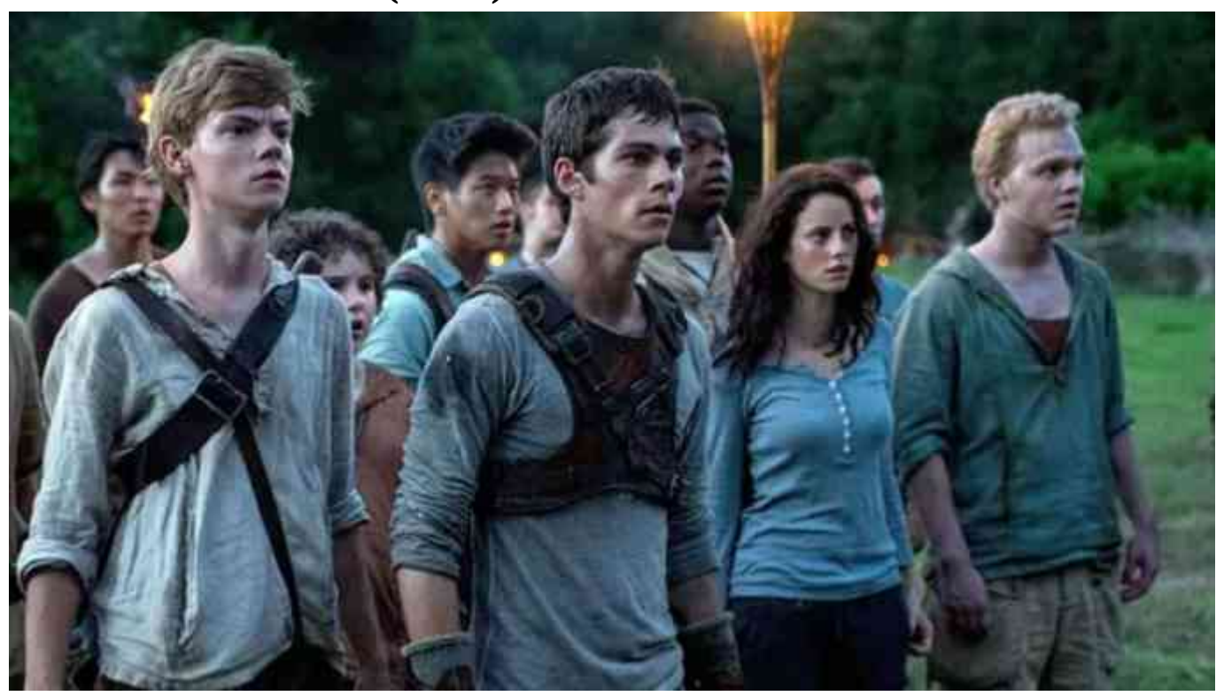
"The Maze Runner" (2014)

Taking the next spot on our list is "The Maze Runner," featuring the story of Thomas, a teenager who finds himself in a mysterious and massive maze with no recollection of his past. As he navigates through the intricate labyrinth with a group of other boys, they realize that their predicament might just be the key to a much bigger puzzle.