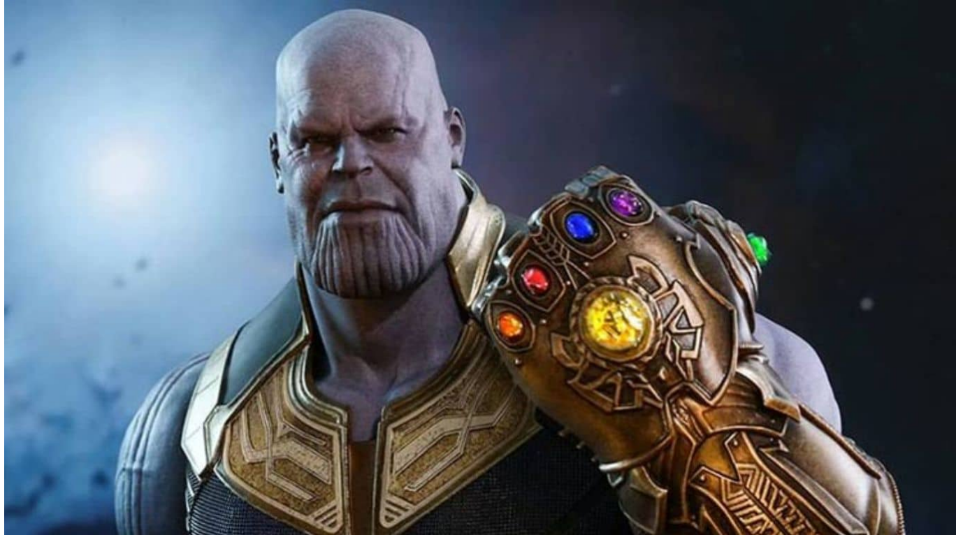
The Infinity Gauntlet

Infinity Gauntlet, a cosmic masterpiece in the Marvel Universe, stands as a symbol of unparalleled power. Fashioned to house the six all-encompassing Infinity Stones—Time, Space, Reality, Power, Mind, and Soul—it grants omnipotence to its bearer. When united, the stones bestow dominion over fundamental aspects of existence, allowing reality manipulation, time travel, and control over the very fabric of space.