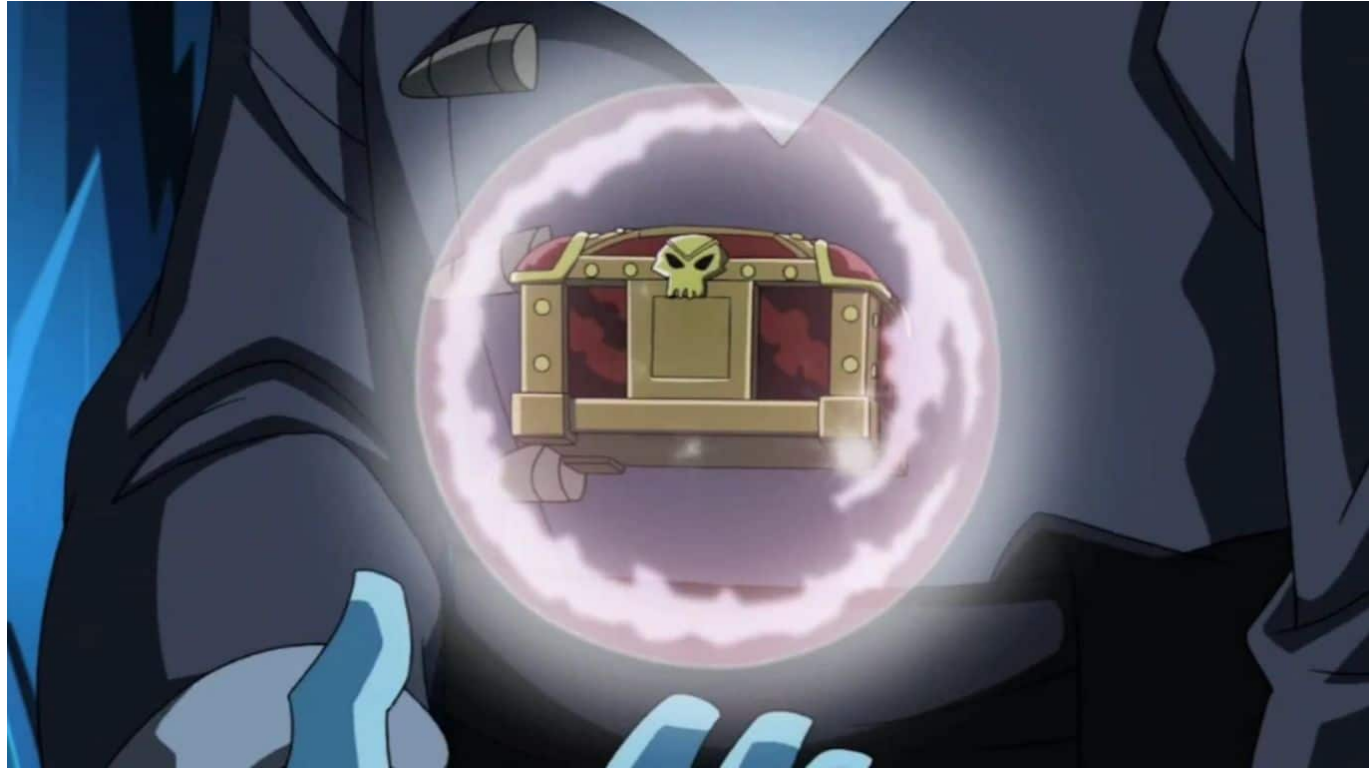
Casket of Ancient Winters

The Casket of Ancient Winters, a seemingly unassuming relic from the Asgardian realm, conceals a chilling and devastating power within the Marvel Universe. This unadorned box, adorned with enigmatic carvings, contains the malevolent Fimbulwinter of Ymir, a cosmic force capable of plunging entire realms into icy oblivion.