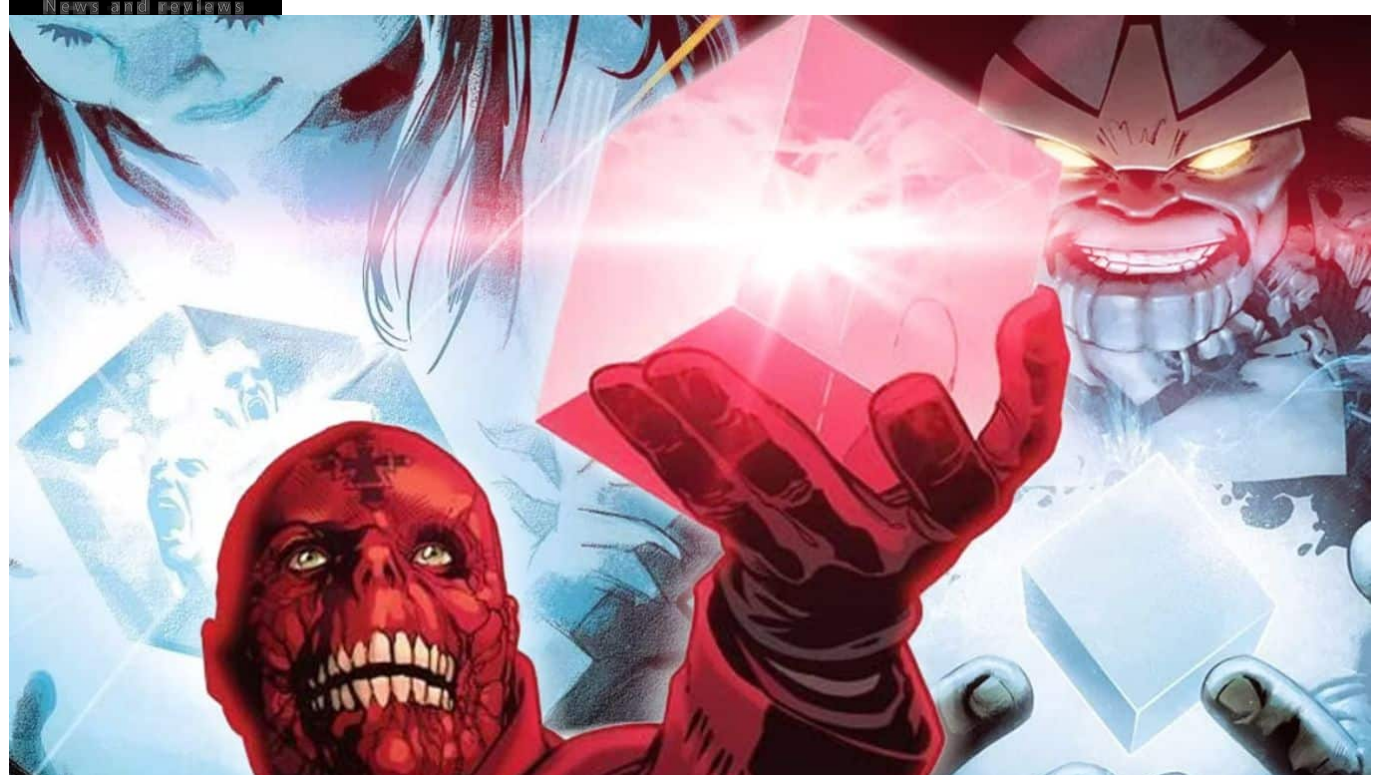
10 Most Powerful Artifacts In The Marvel Universe - Cosmic Cube

The Cosmic Cube, a revered relic in the Marvel Universe, embodies the essence of limitless potential. This enigmatic object is an embodiment of raw cosmic power, capable of reshaping reality itself according to the desires of its possessor. Whether manipulated by heroes or villains, the cube's capabilities remain awe-inspiring and dangerous. It grants dominion over time, matter, and energy, making it one of the most coveted artifacts in existence.