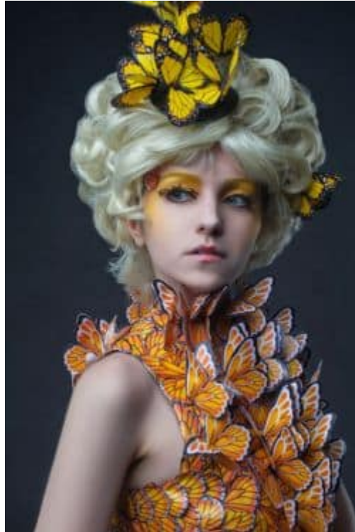
Effie Trinket (The Hunger Games)

A memorable character Effie Trinket is from Suzanne Collins' The Hunger Games . She serves as the District 12 escort, known for her colorful outfits and rigid adherence to Capitol customs.