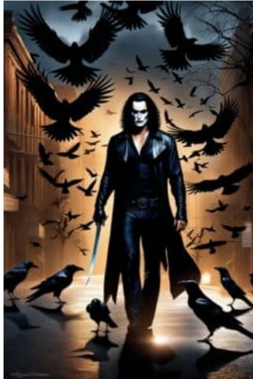
Eric Draven (The Crow)