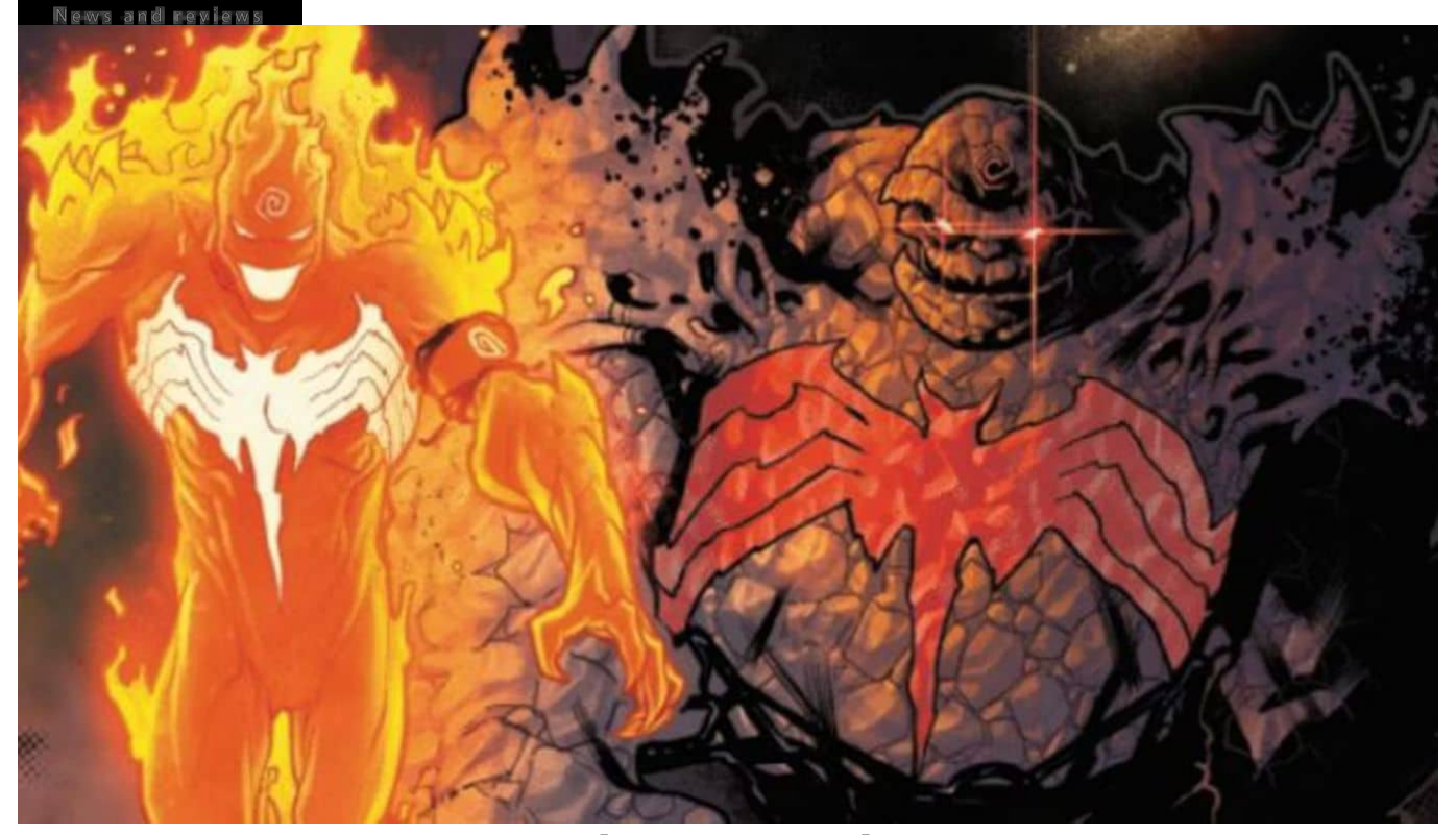
The Human Torch

In the non-canon 'Spider-Man and the Fantastic Four in... Brain Drain!' (2006), Johnny is taken over by a symbiote. The fiery hero's powers make for a surreal symbiote display, combining his trademark flames with the characteristic black and white symbiote aesthetic. This gives him a terrifying yet captivating appearance. It's a fusion that provides an intriguing spin on the traditional Symbiote narrative, underscoring the Marvel Universe's boundless potential for extraordinary and unforeseen hero-villain crossovers.