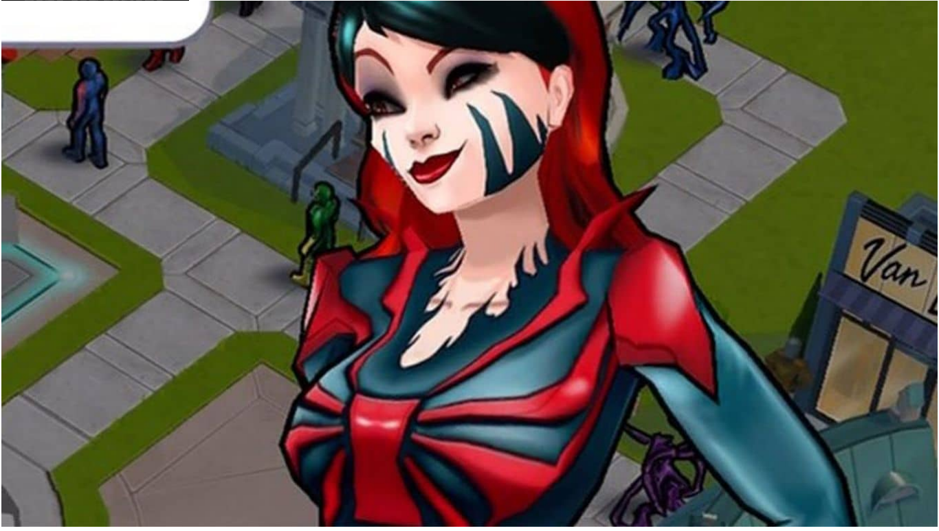
10 Marvel Superheroes You Had No Idea Bonded With Symbiotes - Black Widow The master spy and a key member of the Avengers, has also encountered a symbiote. In the series "Web of Venom: Ve'Nam" (2018), a black-ops version of the Venom symbiote is used to create a super-soldier serum. Natasha Romanoff, a.k.a. Black Widow, is one of the unsuspecting recipients. The symbiote enhances her already formidable abilities, giving her increased strength, speed, and resilience, along with shape-shifting capabilities. This unprecedented combination showcases Black Widow in a new light, demonstrating the shocking results when Marvel's superheroes cross paths with symbiotes.