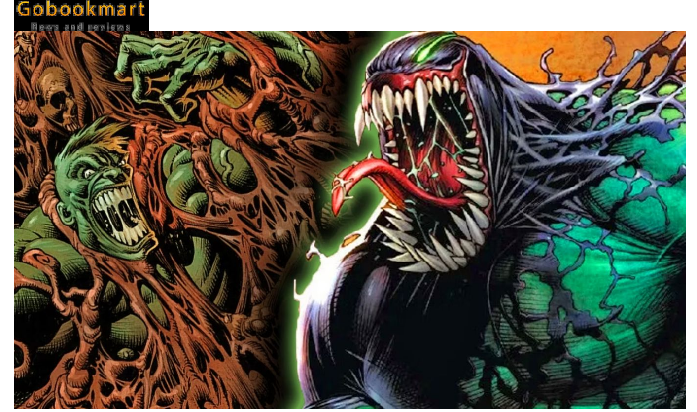
10 Marvel Superheroes You Had No Idea Bonded With Symbiotes - Hulk In the comic book realm, even the mighty Hulk hasn't escaped symbiote influence. In the "Venomized" storyline (2018), Hulk becomes bonded with a Venom-like symbiote. The result is a beastly figure combining the Hulk's raw strength with the symbiote's adaptable abilities. This fusion creates a Hulk with shape-shifting power, amplified strength, and a chilling aesthetic, enhancing the fear factor of the already terrifying superhero. Hulk's symbiote bond not only highlights the extent of the symbiotes' reach but also showcases what can happen when Marvel's strongest entities collide in unexpected ways.