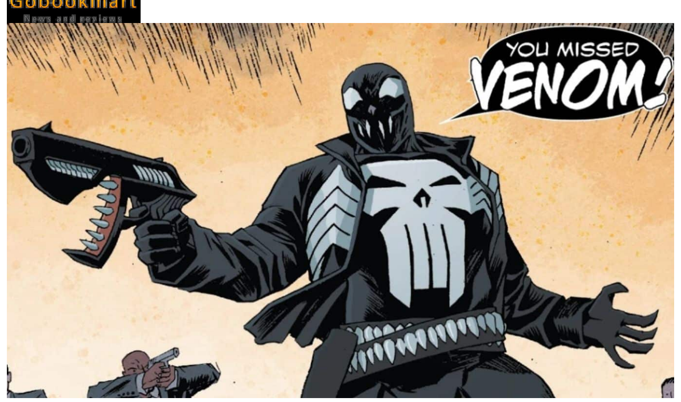
10 Marvel Superheroes You Had No Idea Bonded With Symbiotes - The Punisher The Punisher, known for his brutal vigilante justice, found himself imbued with even darker powers in the "Venomized" series by Cullen Bunn. Forced to bond with a symbiote by the Poison versions of Moon Knight and Daredevil, Frank Castle didn't hold back from using these new abilities to amplify his already ruthless methods. With the symbiote, he could shapeshift, gain superhuman strength, and heal faster. Despite the temporary nature of this union, it offered a thrilling glimpse into an even more terrifying version of The Punisher. This instance again demonstrated the symbiotes' power, as they seamlessly bonded with one of Marvel's deadliest antiheroes.

Also Read: Ranking the Top 10 Superpowers in DC Comics