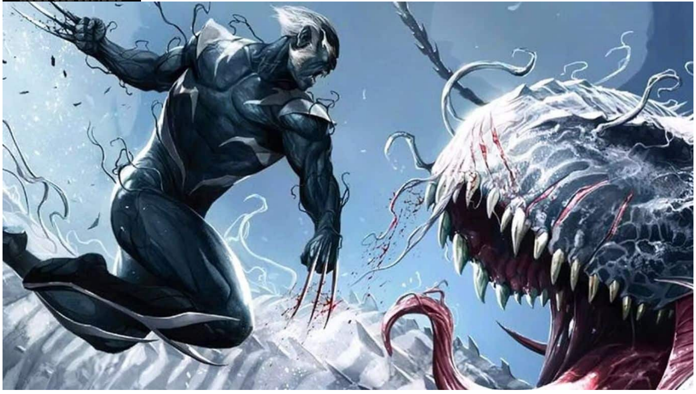
10 Marvel Superheroes You Had No Idea Bonded With Symbiotes - Wolverine Even the ferocious Wolverine isn't immune to symbiotes' influence. In "What If? Venom/Logan" (2018), an alternate reality sees Wolverine bonding with the Venom symbiote after it's discarded by Spider-Man. The symbiote amplifies Wolverine's already formidable abilities, transforming him into a monstrous creature of nightmares. This melding of Wolverine's regenerative power and raw aggression with the symbiote's shape-shifting and enhanced strength creates a truly terrifying entity. It's an unexpected twist that showcases how even the most hardened Marvel superheroes can become entangled in the sinister world of symbiotes.