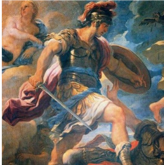
10 Great Heroes of Greek Mythology - Aeneas

A great warrior during the Trojan war, Aeneas was one of the only people to survive when the Greeks defeated the Trojans. He has connections with the Greek gods, and is the protagonist of Virgil's classic Aeneid. In fact, he is also the founder of the ancient city of Rome, and one of the most beloved heroes in both Greek and Roman mythology.