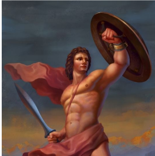
10 Great Heroes of Greek Mythology - Heracles

Son of Zeus, the God of the Sky and ruler of all other gods, Heracles (alias Hercules) is perhaps the most beloved and popular Greek Hero. This terrifically strong warrior has a wonderful backstory. Zeus' wife Hera temporarily drove him insane, leading to catastrophic events. To atone for his deeds, Heracles had to perform 12 heroic tasks.