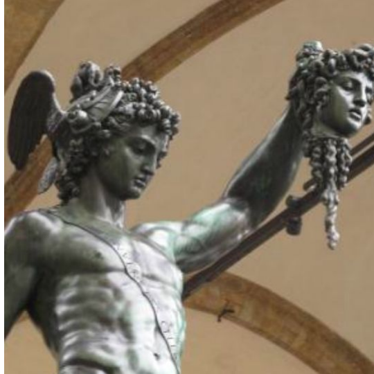
Great Greek gods And Demigods - Perseus

Perseus is the hero who slew the Gorgon Medusa, who had snakes for her hair and could turn anyone who looked at her into a stone statue. He is also the founder of the legendary city Mycenae and a great warrior king in his own right.