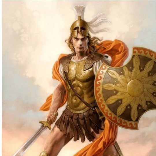
10 Great Heroes of Greek Mythology - Achilles

This Greek hero is invincible, except for one heel, because his mother dipped him as an infant into the River Styx. While doing that his mother held him by one of his heel. Thus, his heel is the only vulnerable body part, making him almost immortal. He then serves as a warrior in the Trojan war, winning innumerable battles and defending his country. However, the son of the Trojan King, Paris with the help of the God Apollo, ultimately defeats him due to his mortal heel. Even today, the 'chink in an armour' is called an Achilles' heel.