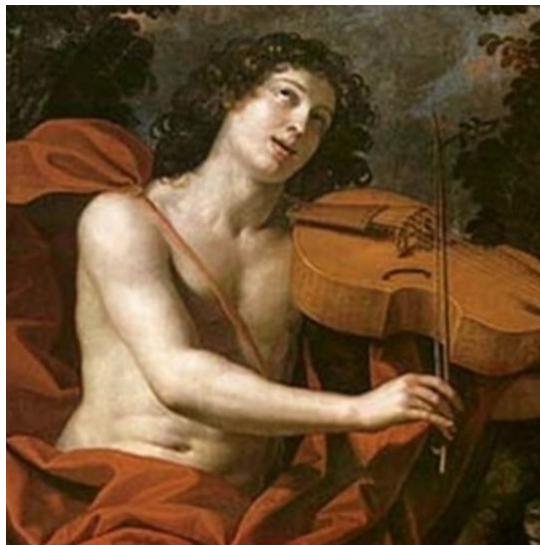
10 Great Heroes of Greek Mythology - Orpheus

Orpheus is not only a gifted warrior of Greece but also one of its most talented artists. Popular for his knack with the lyre, Orpheus is a musician of the highest order. He also has unbridled courage, as he journeys to the underworld to reclaim his wife Eurydice from the clutches of Hades. He also wrote poetry and travelled in search of the Golden Fleece with Jason.