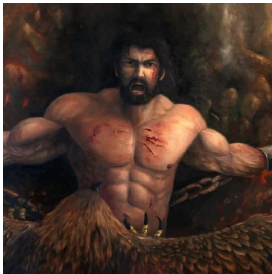
Great Greek gods And Demigods - Prometheus

In the ancient war between the Titans and the Olympians, the Olympians defeated the Titans. Even though Prometheus took birth in the Titan community, he knew their defeat was unavoidable. And so he became a close ally of Zeus but ended up betraying the God by giving mankind access to fire. For this, he suffered severe punishment as well.