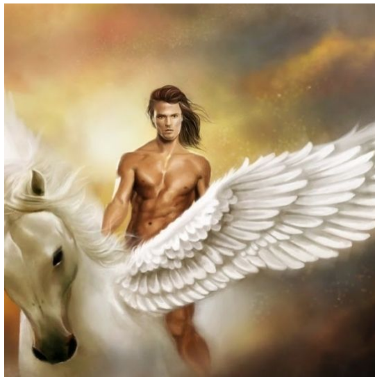
Great Greek gods And Demigods - Bellerophon