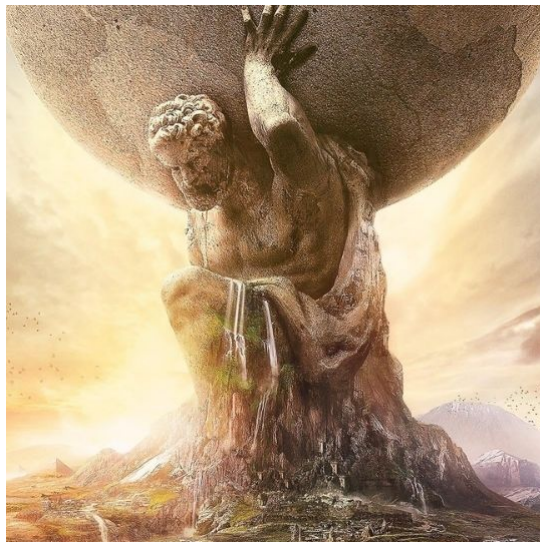
Great Greek gods And Demigods - Atlas