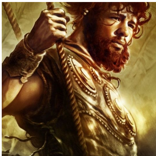
10 Great Heroes of Greek Mythology - Odysseus