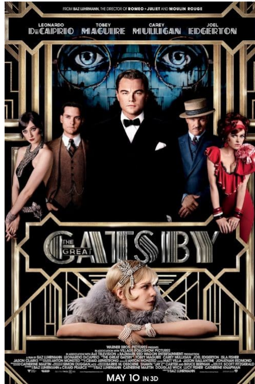
“The Great Gatsby” (2013)

One of the most common criticisms of the film “The Great Gatsby” was that it deviated too far from the source material. While Luhrmann stayed true to the basic plot and characters of the novel, he took many liberties with the setting and tone of the story. For example, the film used modern music and visuals, which some fans felt clashed with the 1920s setting of the story and undermined its historical context.