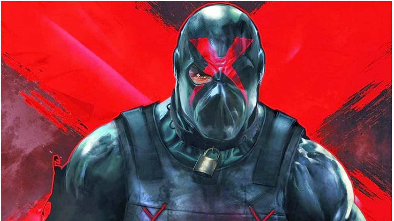
10 Best Heroes From Dark Horse Comics - X

Debuting in Dark Horse Comics #8, X quickly garnered a dedicated following, leading to the launch of his own series in February 1994. Set in the Comics Greatest World imprint, X's relentless drive for justice and propensity to kill set him apart from conventional heroes.