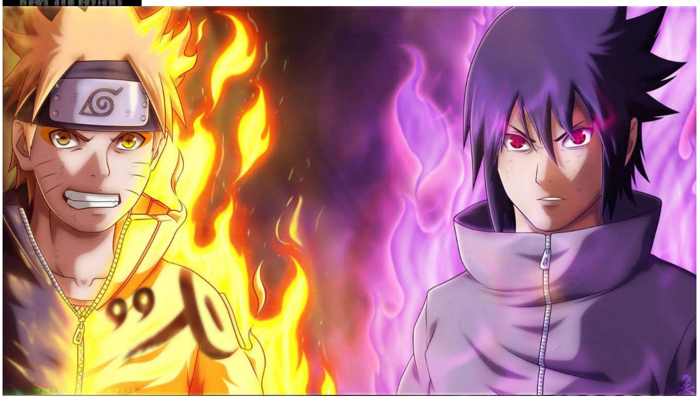
Sasuke Uchiha (Naruto)

Traumatized by the murder of his village, his anger, arrogance, and desire for revenge propelled him into a bitter rivalry with Naruto. As he grappled with his limitations, his desire to kill his brother led him to betray the Village Hidden in the Leaves and become an agent for Orochimaru. His villainous turn continued as he joined Akatsuki, the main antagonistic organization, and even challenged all the Kage. This transformation not only showcases Sasuke's power but also cements his status as a character whose shift from hero to villain is filled with turmoil, ambition, and relentless pursuit of a dark path.