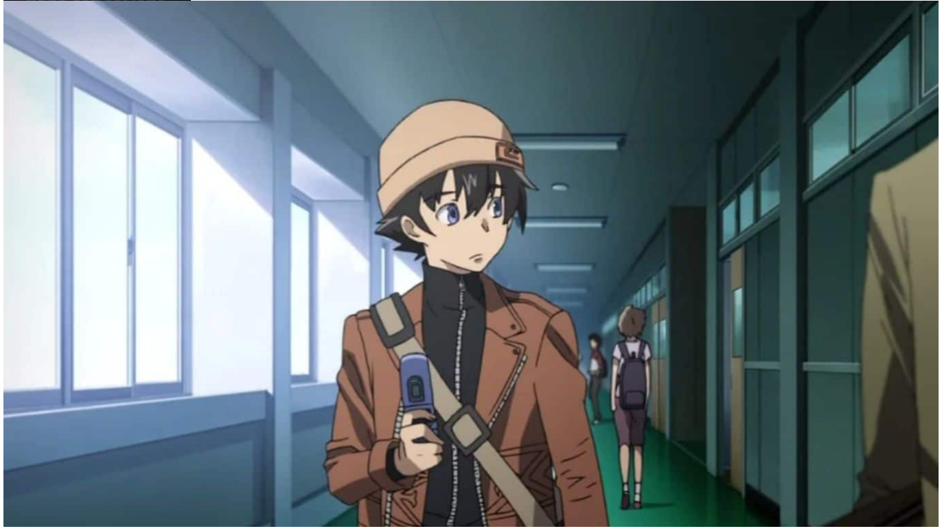
10 Anime Heroes Who Became Villain - Yukiteru Amano (Future Diary)

Yukiteru Amano's transformation in "Future Diary" is a gradual descent from an innocent, tearful high school kid to a ruthless player in a lethal death game. Initially drawn into the game against his will, his exposure to constant danger and his complex relationship with Yuno lead him down a dark path. The once-reluctant participant becomes increasingly complicit in betrayal and murder, losing his innocence along the way. Yukiteru's transformation is a compelling study of how circumstances and relationships can erode morality and compassion, turning an unlikely character into one of the game's most merciless competitors. His evolution from a crybaby to a cold-blooded participant adds depth and intensity to the series, underscoring the dark themes at its heart.