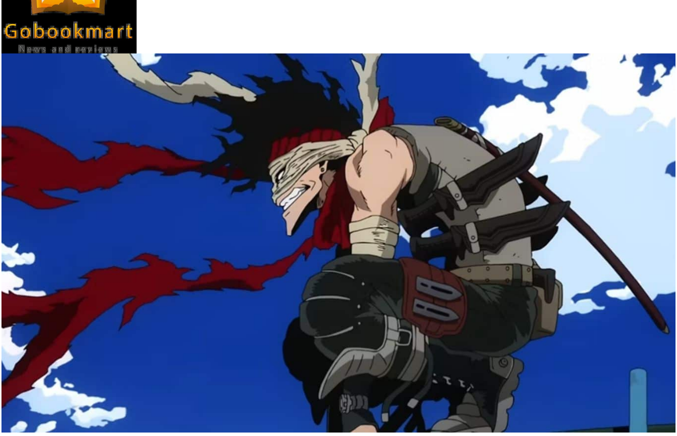
Stain (My Hero Academia)

Once an aspiring hero who looked up to figures like All Might, Stain's shock at the corrupt and insincere nature of hero society led him to a darker path. Driven by a twisted sense of justice, he dedicated his life to purging the world of heroes he deemed unworthy, killing or injuring many in the process. Stain's story offers a compelling and cautionary tale about how noble intentions can become perverted when faced with harsh realities. His journey from aspiring student to fearsome villain exposes the underlying cracks in the world of professional heroes, making his character one of the most complex and intriguing in the series.