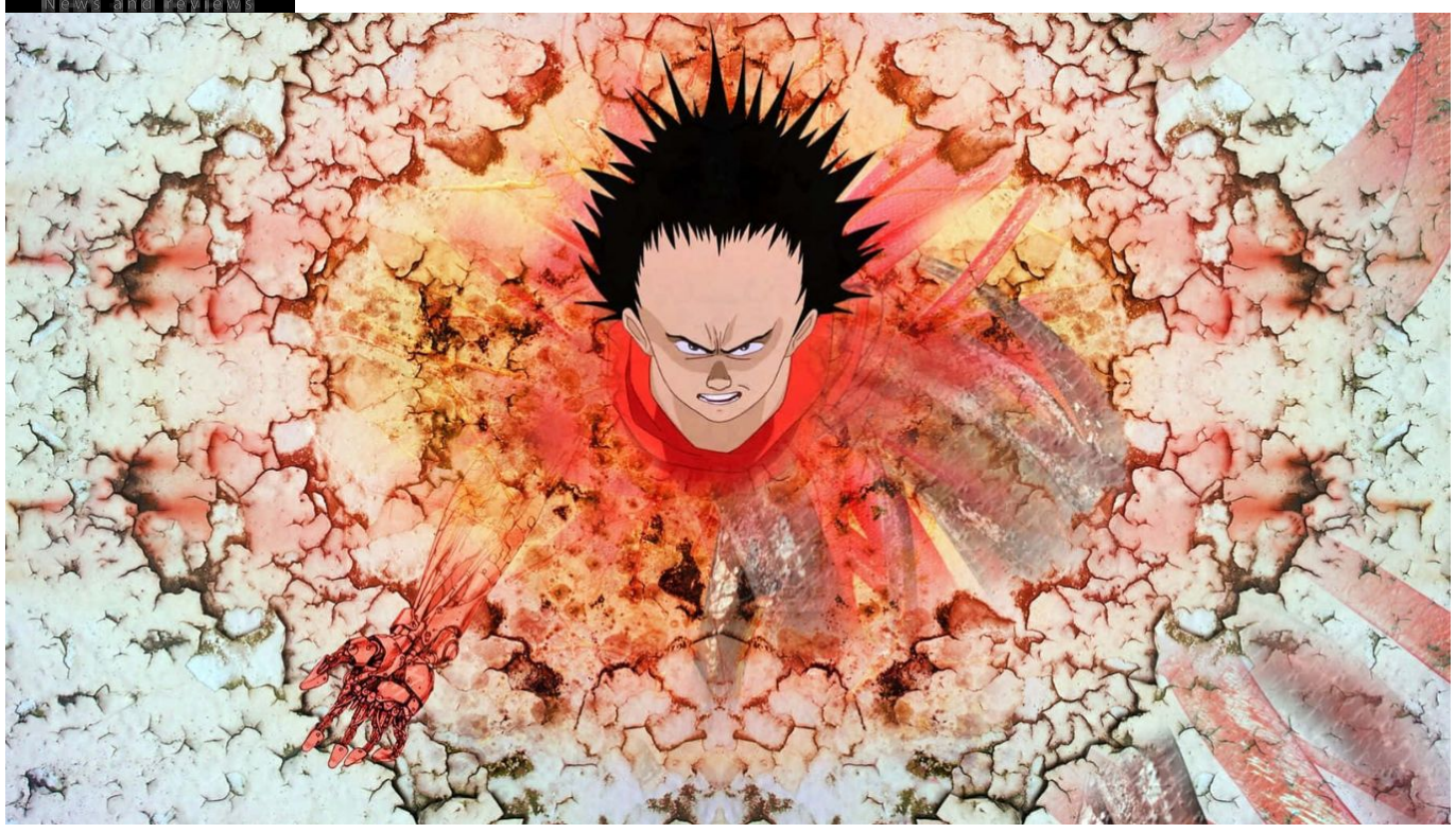
Tetsuo Shima (Akira)

Initially portrayed as a decent individual and friend to Kaneda, Tetsuo's underlying inferiority complex and aggressive tendencies are soon exposed when he acquires psychic abilities. Driven by his newfound power, he embarks on a reckless quest to find Akira, showing no regard for those who cross his path. He kills and harms, even turning on his gang and friends. His confrontation with Kaneda reveals the true extent of his transformation from a troubled friend to an uncontrollable villain. Ironically, the powers that facilitated his descent also led to his grotesque downfall, reflecting the tragic consequences of unchecked ambition and power.