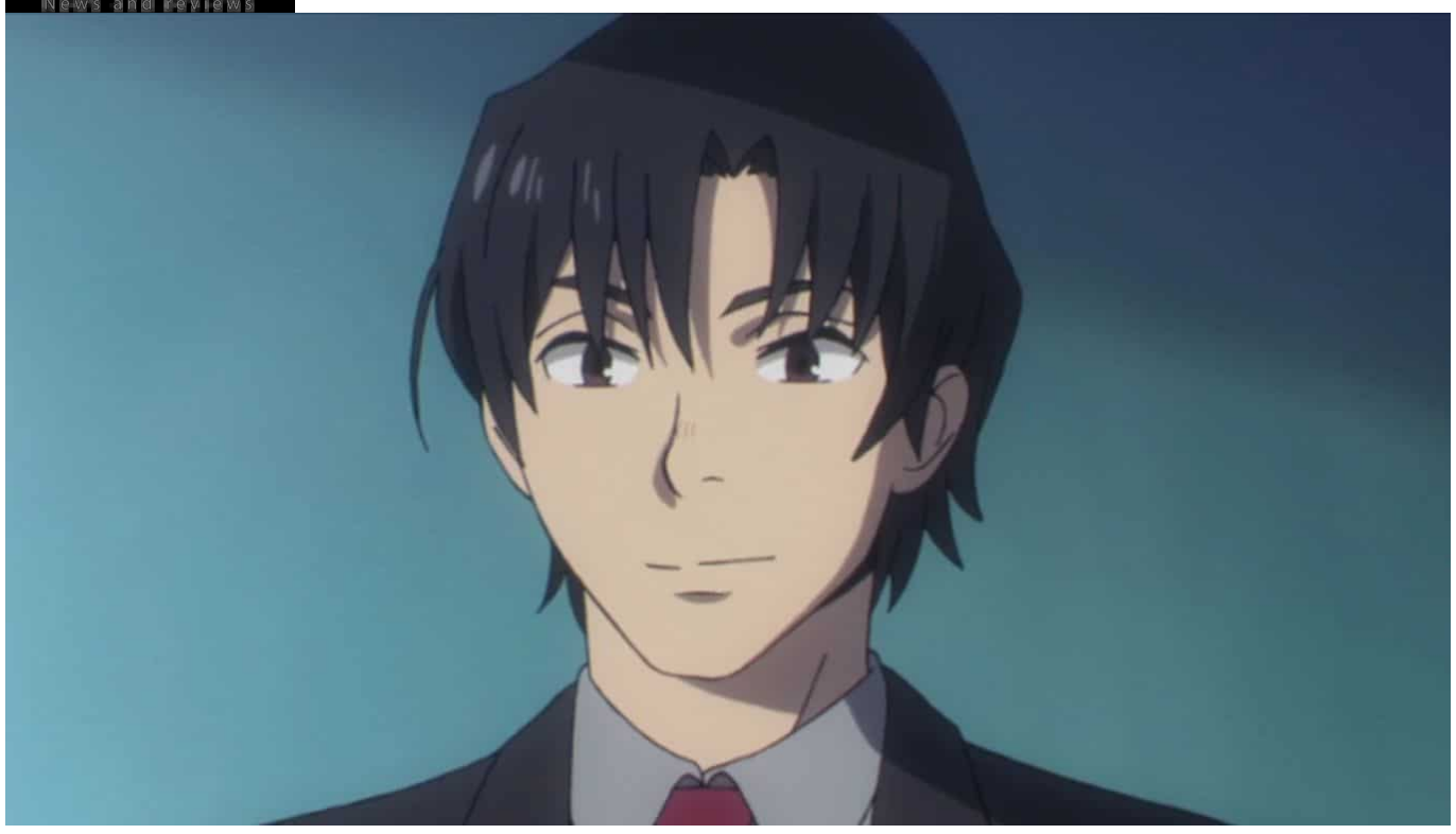
Gaku Yashiro (Erased)

The revelation of Gaku Yashiro as a villain in "Erased" was a shocking twist. As a caring teacher, he was admired and even looked up to as a father figure by the protagonist, Satoru. The unveiling of his true nature as a cold-blooded child murderer completely shattered this image. Gaku's enjoyment in killing and the complex, rivalry-like relationship he had with Satoru added layers of intrigue to his character. This turn of events was not just a plot twist but a profound betrayal that gave depth to the story and raised questions about trust and human nature. Gaku's transformation from a figure of support to a menacing antagonist encapsulates the unexpected and intricate character development found in contemporary anime.