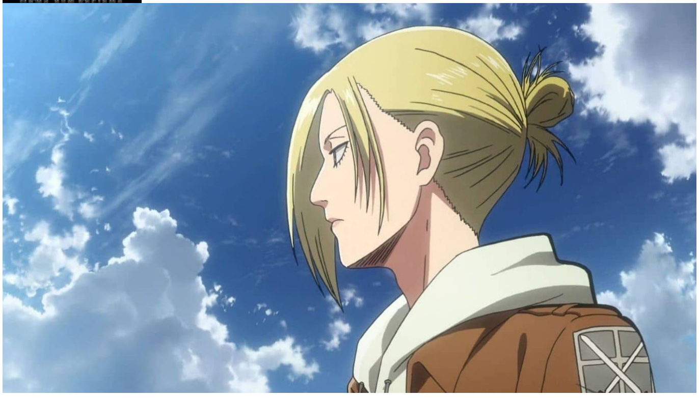
10 Anime Heroes Who Became Villain - Annie Leonhart (Attack On Titan)

Leonhart's transformation from a seemingly strong and stoic cadet to the brutal Female Titan is a complex arc in "Attack on Titan." Her single-minded mission to see her father again led her to commit horrendous acts without remorse, including the massacre of many soldiers. Her rivalry with Mikasa was overshadowed by her shocking revelation, and her subsequent crystallization kept her secrets intact for years. Upon her release, her unapologetic stance and readiness to ally with former enemies highlight a pragmatism and determination that make her character intriguing. Her transformation from a hero to a villain, driven by personal motives rather than pure evil, adds depth and nuance to the storyline, making her one of the most compelling characters in the series.