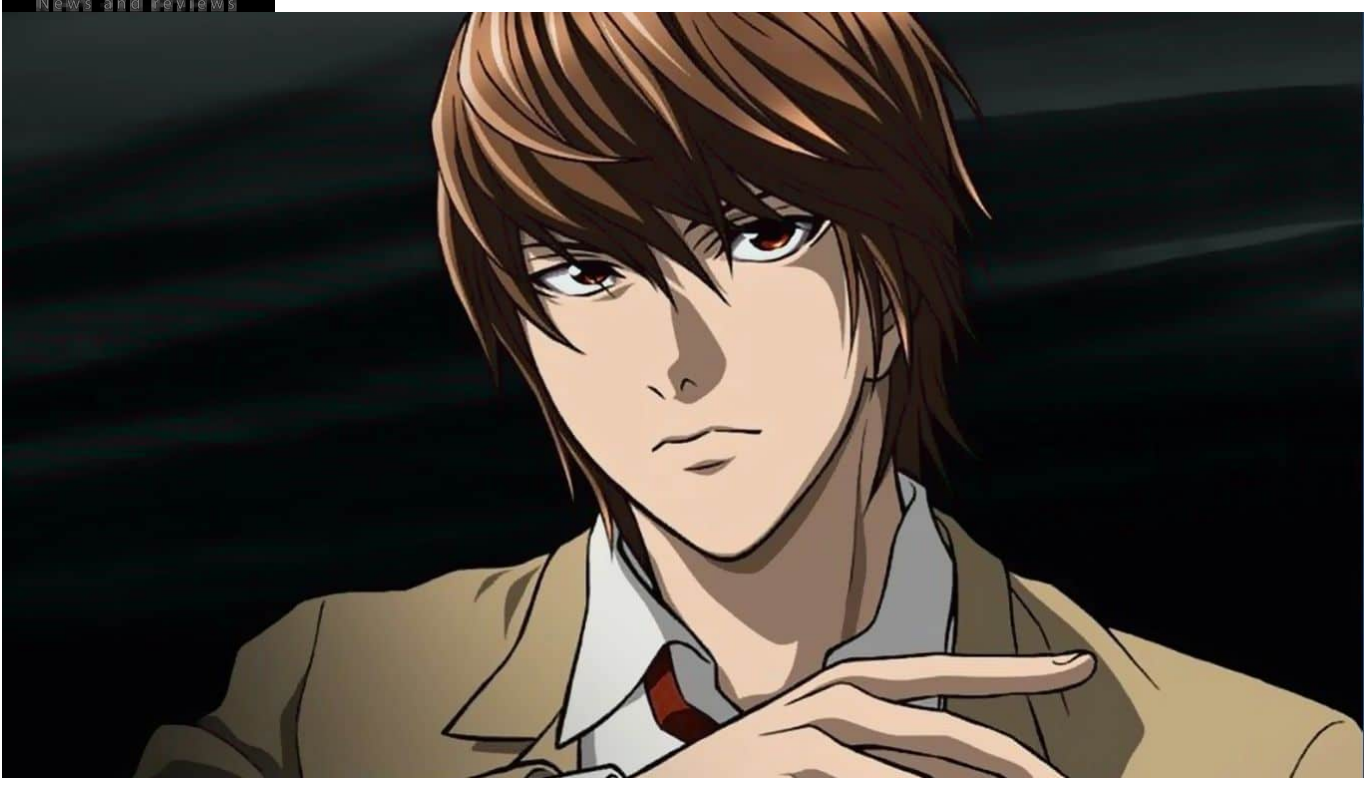
10 Anime Heroes Who Became Villain - Light Yagami (Death Note)

Yagami's transformation from a just crusader to a ruthless villain in "Death Note" is a haunting descent into power's corrupting influence. Initially utilizing the Death Note to eliminate criminals, Light's intentions were rooted in justice. However, the introduction of the enigmatic L sparked a fear in Light, leading him to methodically eliminate anyone he perceived as a threat. Manipulating allies and killing opponents, Light's moral compass began to waver. A brief loss of memory revealed his underlying reluctance to use others and kill, illustrating how possession of the Death Note fundamentally altered him. What began as a righteous mission evolved into a self-serving, cruel pursuit, marking Light's tragic transition from hero to villain.